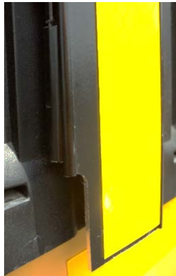
Egress window hinge (edge toward front of bus)