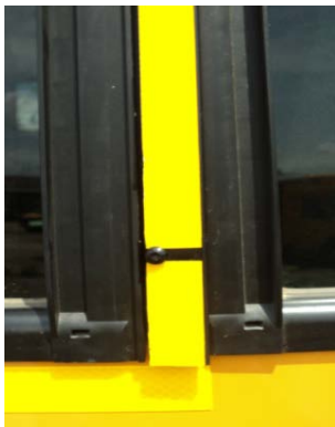
Screws on retainer bar close to egress window.(driver's side shown, with egress window to the left)

Step 1:: Check window retaining bars for correct installation. On the egress window, the edge toward the front of the bus is the hinge. The retainer bar on the edge toward the rear of the bus is approximately 1" wide (as opposed to a standard retainer bar which is 1 9/16" wide) and has the screw holes set close to one side. That side of the bar goes next to the egress window, NOT next to the adjacent window. Ensure this bar is installed correctly to properly secure the adjacent window and to allow the egress window to open.