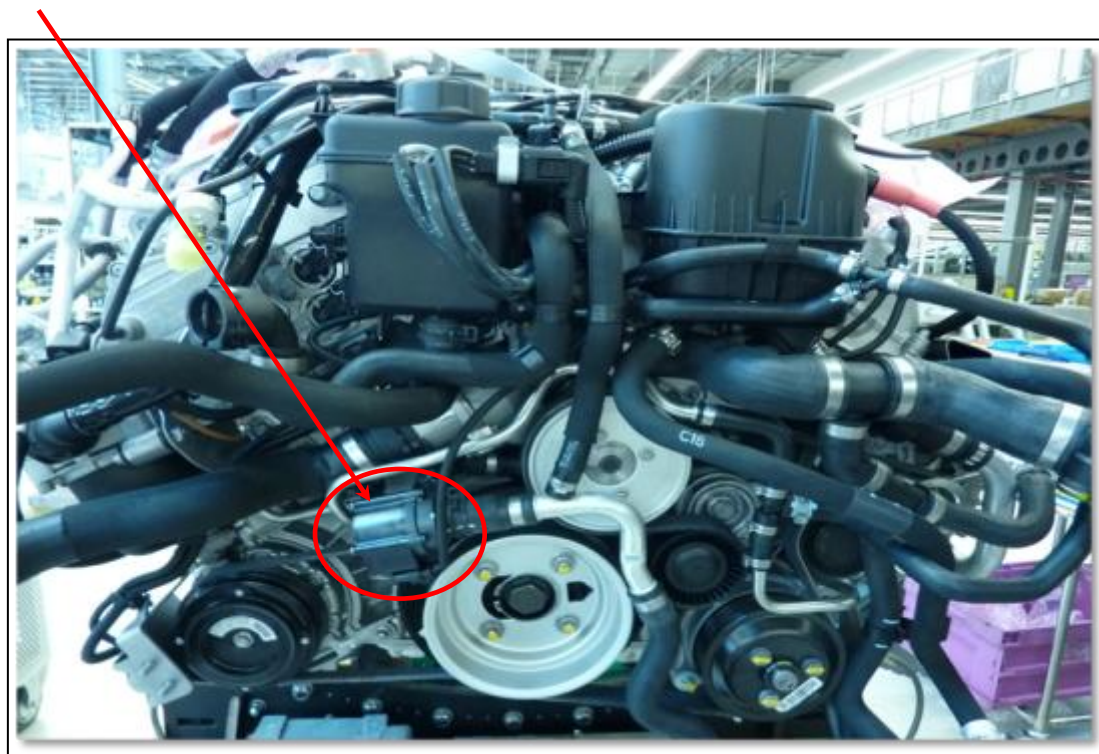
Figure 4, circled above, shows the location of the auxiliary water pump, fitted to the front of the N74R engine.