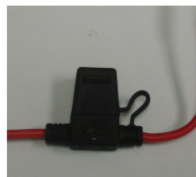
New Fuse Holder