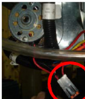
Old Fuse Holder