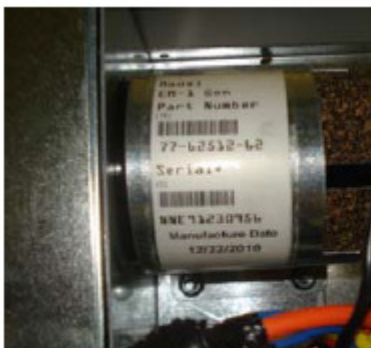
Serial Number Tag

STEP 2) Once the cover has been removed, the identification tag containing the unit part number, manufacture date, and serial number can be found on the motor "cradle" mount, as seen in the photo below (on left). Compare the information to the above mentioned manufacture date, and/or serial number. Units employing a fuse holder as appears circled in red below require the upgrade with the new fuse holder.