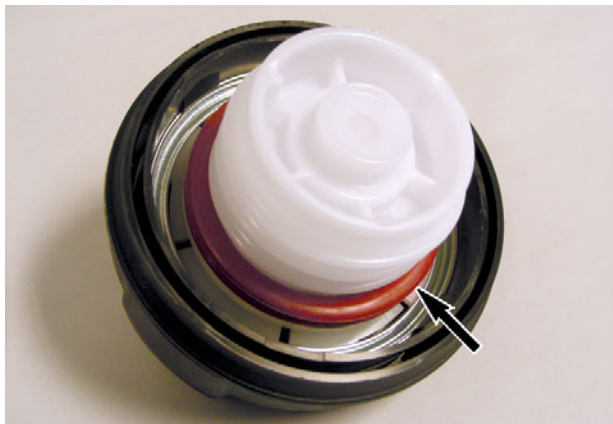
NEW IMPROVED FUEL CAP – REDDISH SEAL

For reference, please see below pictures that will help you identify the new fuel cap which has a reddish color seal AND a different size handle.