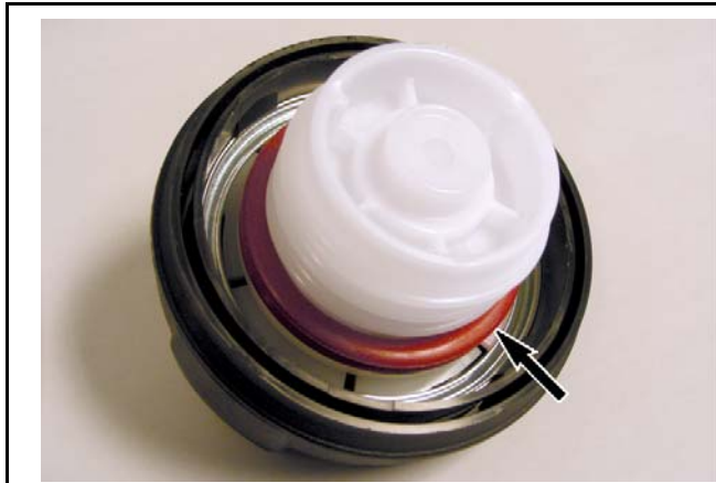
NEW IMPROVED FUEL CAP – REDDISH SEAL

NOTE: For reference, please see below pictures that will help you identify the new fuel cap which has a reddish color seal AND a different size handle.