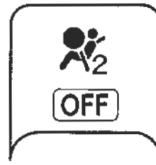
Incorrect airbag indicator