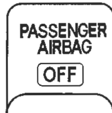
Correct airbag indicator