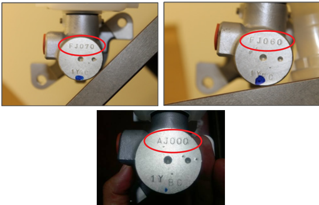
Location of Partial Part Number stamping.

NOTE: Some early production Legacy and Outback were produced with the AJ000 master cylinder, and do not require replacement. Always confirm that the vehicle is affected by checking VIN applicability on Subarunet and verify applicability of any parts by the stamping prior to removal or installation.