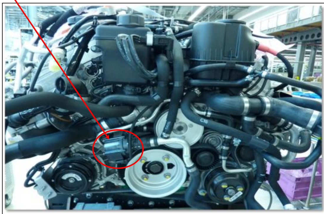
Figure 4, circled above, shows the location of the auxiliary water pump, fitted to the front of the N74R engine.

The repair time has been revised by our Method and Techniques Department. The total repair time has increased from the previous published 16 FRU to 21 FRU.