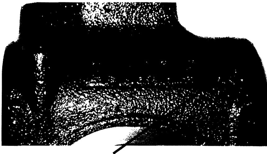
Figure A: Mold Line Nomenclature