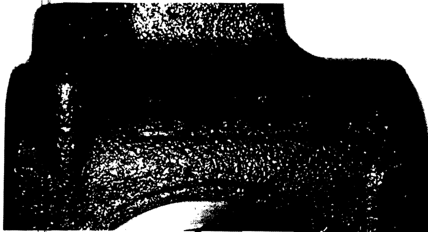
Figure A: Mold Line Nomenclature