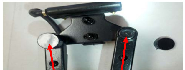
Fig. 1— cover cap no cover cap