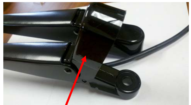
Fig. 2— plastic nut cover

Important: Do not remove the arms by wiggling the arms back and forth until they break loose as this can damage the fiberglass cap and potentially damage the pivot shaft.