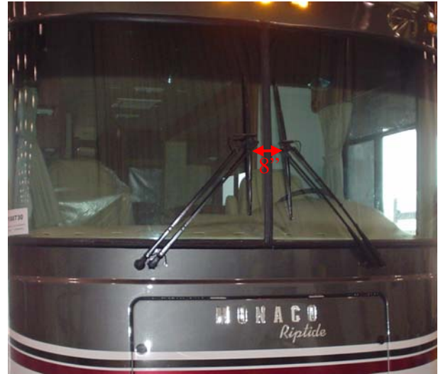
Fig. 3—install wiper arms with 8" between the blades when parked at the center.