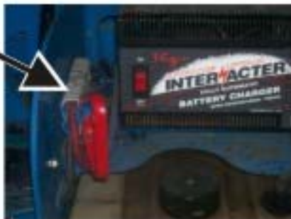
Anderson connector disconnected