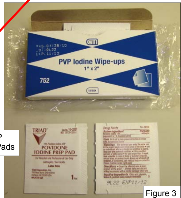
Recalled PVP Iodine Prep Pads