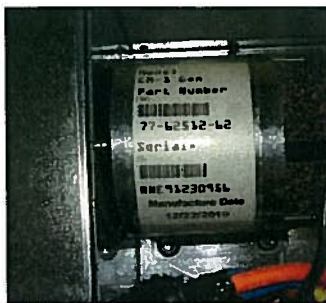
Serial Number Tag