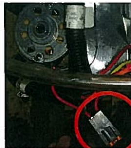
Old Fuse Holder