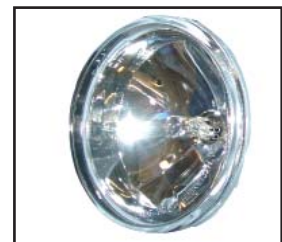
Figure 4 - High-Beam Headlight

If the headlights are not located in the positions described above, proceed to the CORRECTION, Step 2.