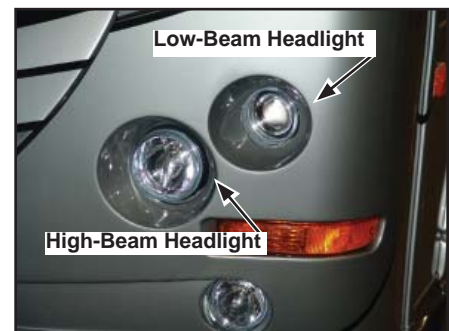
Figure 2 - Correct Headlights