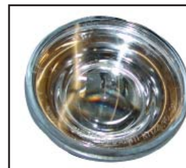
Figure 3 - Low-Beam Headlight