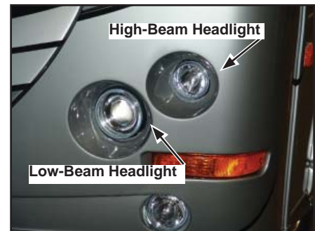
Figure 1 - INCORRECT Headlights