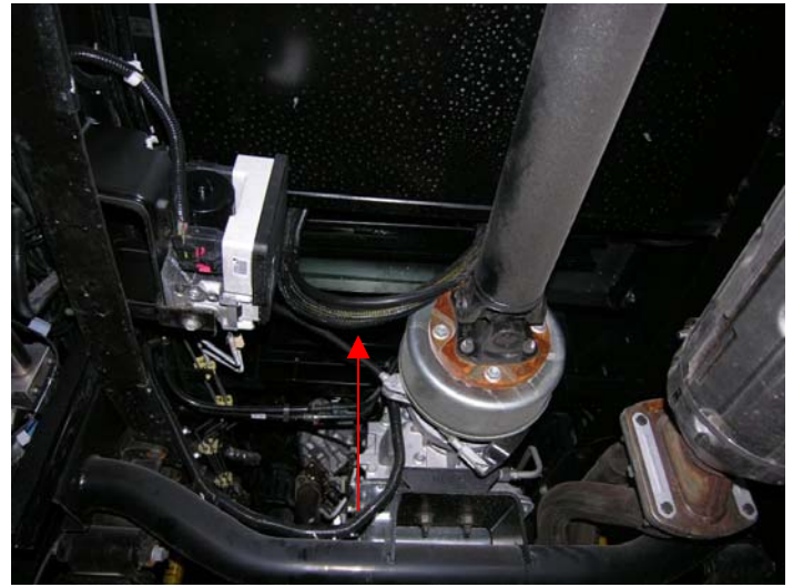
Unsecured Slideout Wire Harness (View looking toward front of chassis)