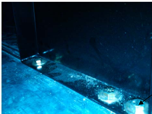
Figure 1 (3 bolts on the floor pedestal)

1) Locate the three 5/8" bolts underneath seat securing the seat pedestal to the floor track mounts and the two 5/8" bolts on the side wall track mount. See Figure 1 and 2 below.