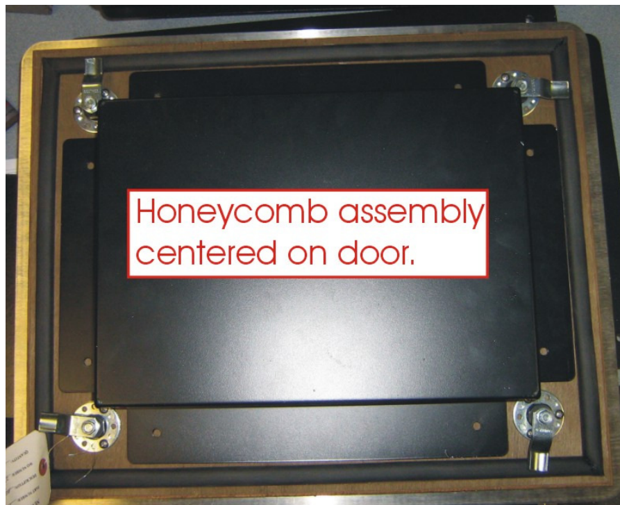
Figure 2: Driveshaft access door assembly.