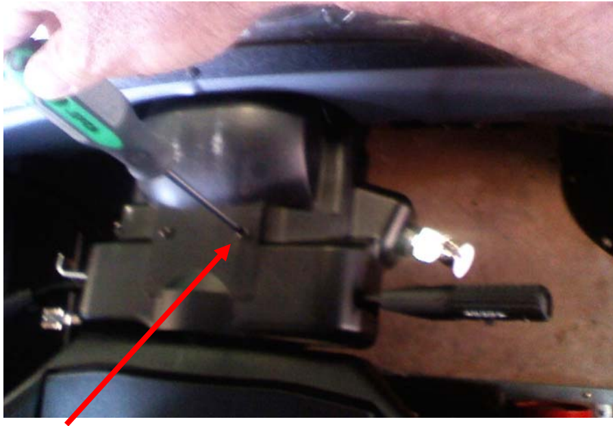
Location of Phillips Screw