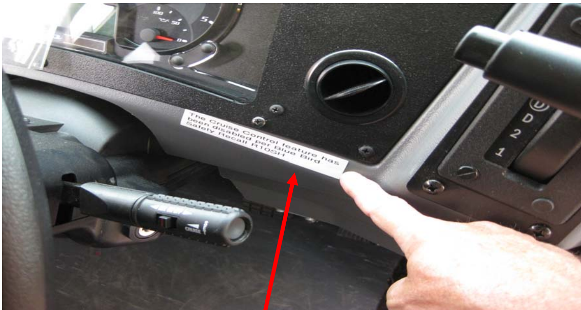
Decal Location on BBCV "Vision" Models