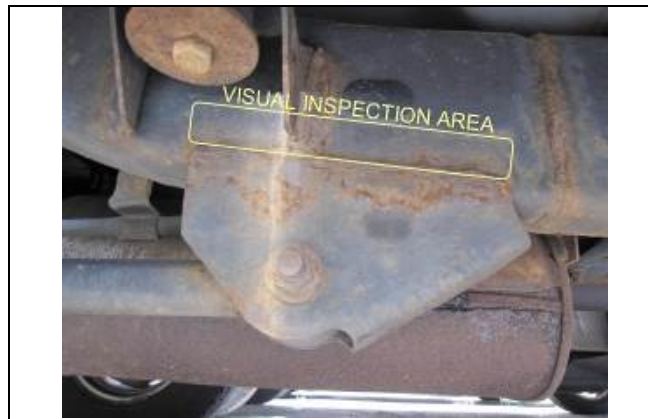
Figure 1 – Visual Inspection Area

NOTE: If the vehicle is equipped with side steps/running boards, it is necessary to remove them in order to complete the following steps.