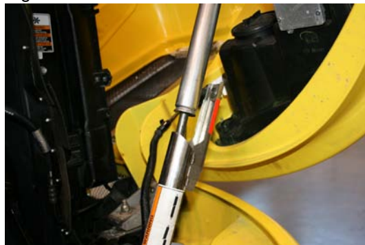
Normal Lock Tube Position w/Hood Open Allowing Bottom Of Strut To Rest On Top Of Lock Tube