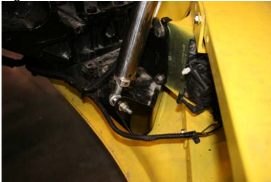
Retaining Pins Missing