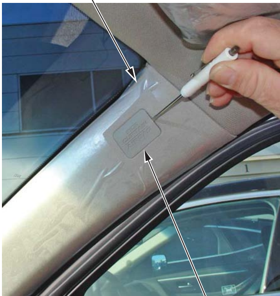
A-PILLAR TRIM COVER