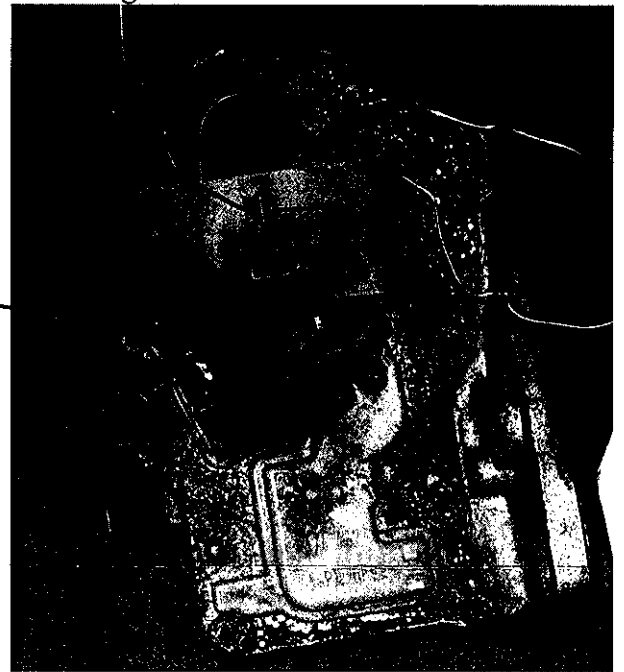
Example of melted connector: (Plastic melted and charred)

The two images below show connectors that exhibit signs of overheating: