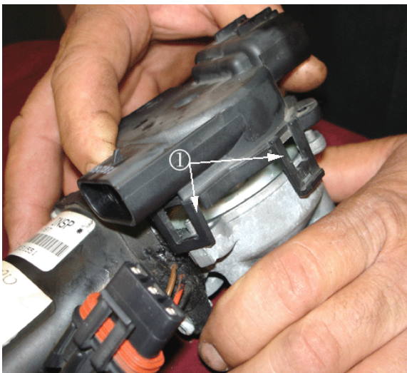
Wiper motor shown out of vehicle for illustration purposes only.