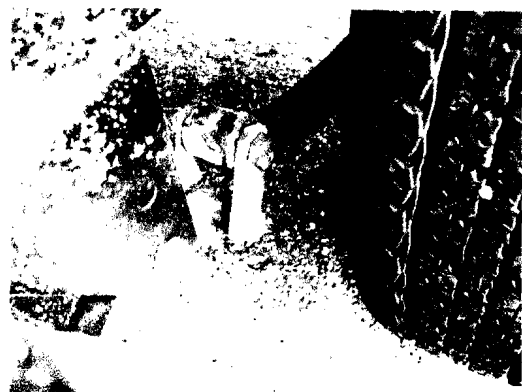
Correct – Bolt Head on Tire Side