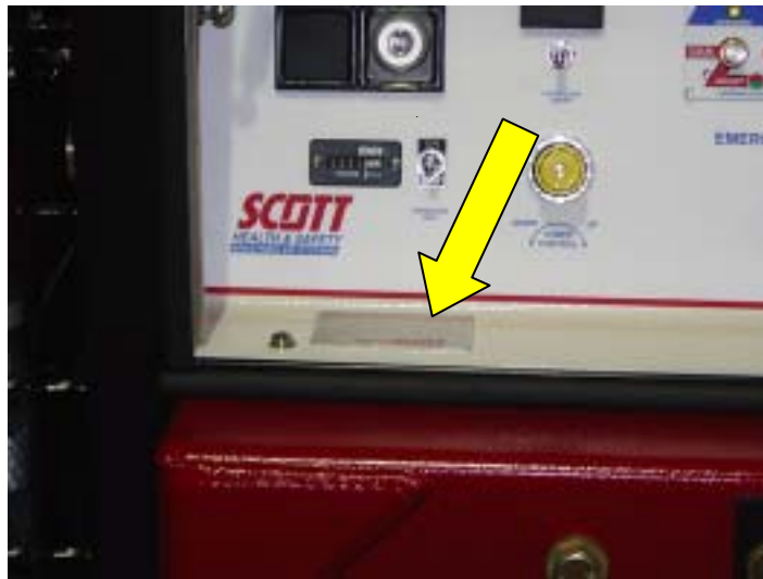
FIGURE 4 – Builders Plate located near the control panel.