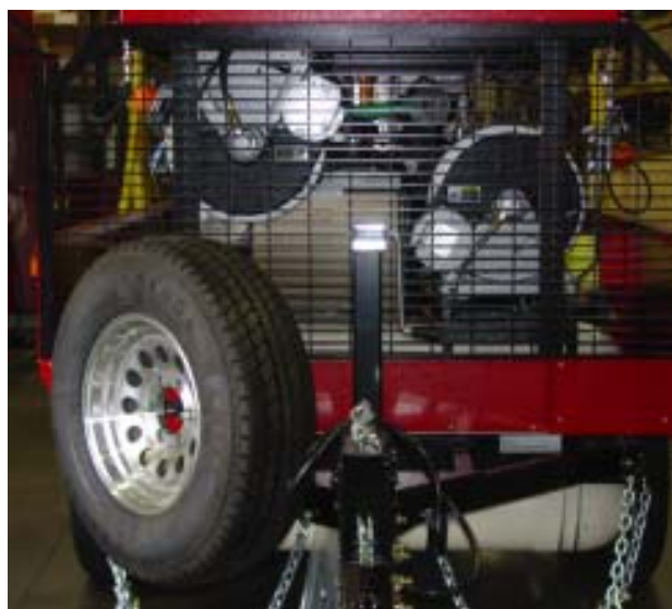
FIGURE 1 – Front View – Liberty Trailer with Spare Tire Mount

All Liberty I and II trailers manufactured by Scott from October 1, 2002 through October 6, 2007 are involved in this recall. FIGURE 1 shows the front of a Liberty trailer showing the location of the spare tire and mount. FIGURE 2 shows the mounted spare tire from the back so you can see the spare tire mount.