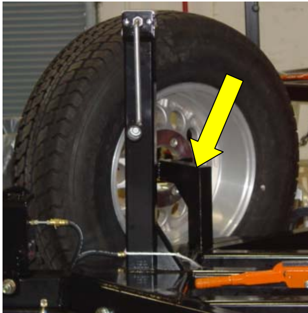
FIGURE 2 – Rear View of Spare Tire Mount

FIGURE 3 shows how the Spare Tire Mount is fastened to the frame of the trailer. Unscrew the two bolts by rotating the bolt heads counterclockwise while preventing rotation of the nuts. Support the trailer mount so it doesn't come loose accidentally while the screws are being removed.