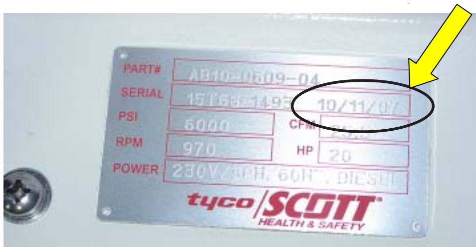
FIGURE 5 – Builders Plate Close-up – Note Manufacture Date

If your Liberty Trailer is included in this notice, do not tow the trailer, park it in a safe place. Remove the spare tire from the spare tire mount and spare tire mount and store them safely or take the trailer to a Scott Authorized Compressor Service center so the tire mount can be removed from the trailer. If the tire mount is not secure, remove the tire mount where trailer is parked. Put the tire mount aside and use the trailer normally until a replacement spare tire mount is received.