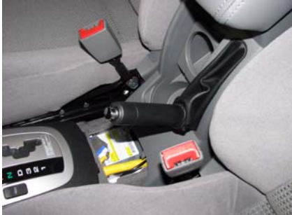
Front view of console raised