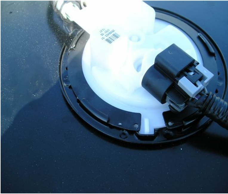
Figure 1 Installation of wide retainer ring on two leg fuel pumps.