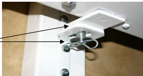
Figure 1 View of pin with washer. This is correct.

Verify flat washers are installed as shown here on both the top and bottom of the pin.