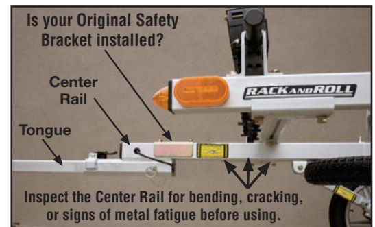
Fig. A - Center Rail with Original Safety Bracket Installed