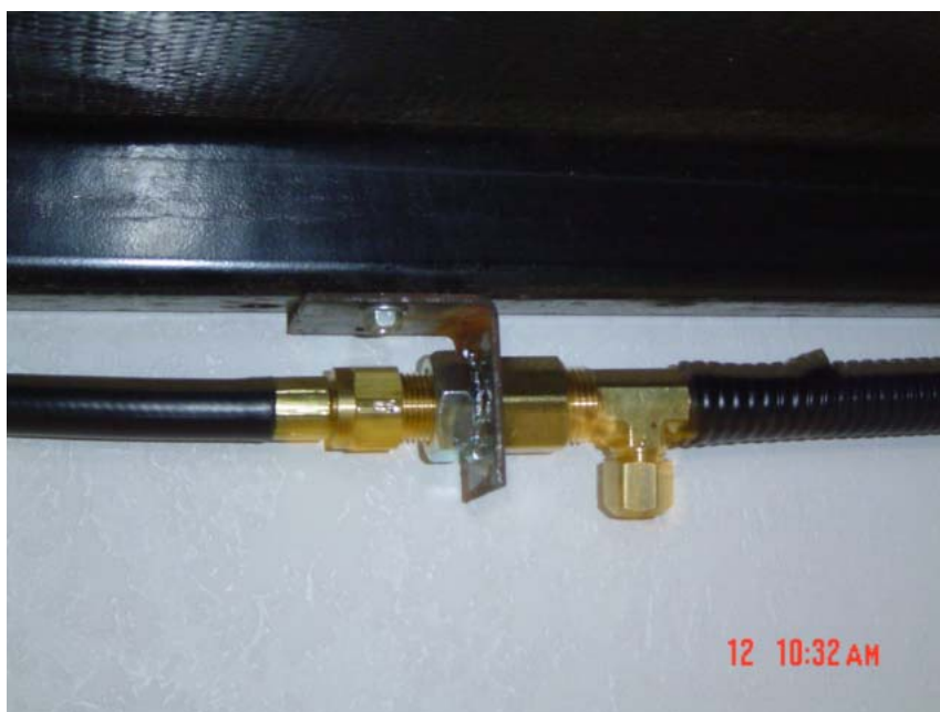
Fig 2 2