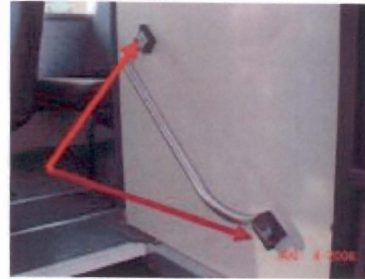
Figure 4 – Handle with spacers