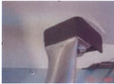
Figure 3 – Spacer