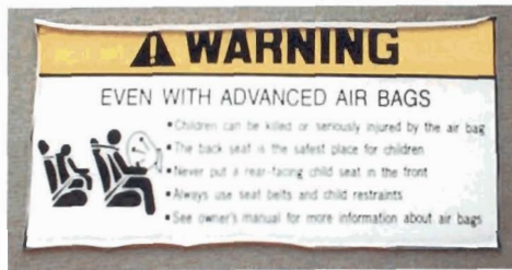
“Advanced Air Bags” Label Top Surface of Sun Visors