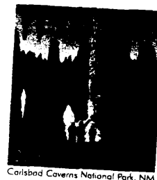
Carlsbad Caverns National Park, NM