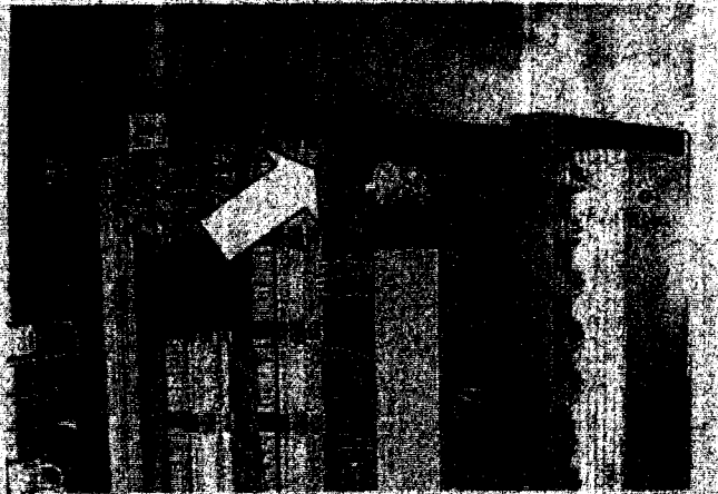
Figure 2: Open top J-box