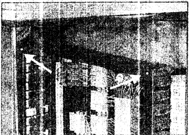
Figure 4: Cover VH 10861312 installed