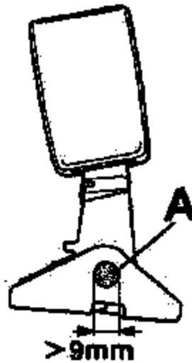
Figure 2 The axle pin of the single and double belt buckle is riveted correctly, if the measured rivet head diameter (Figure 2, item A) is 9 mm or larger.