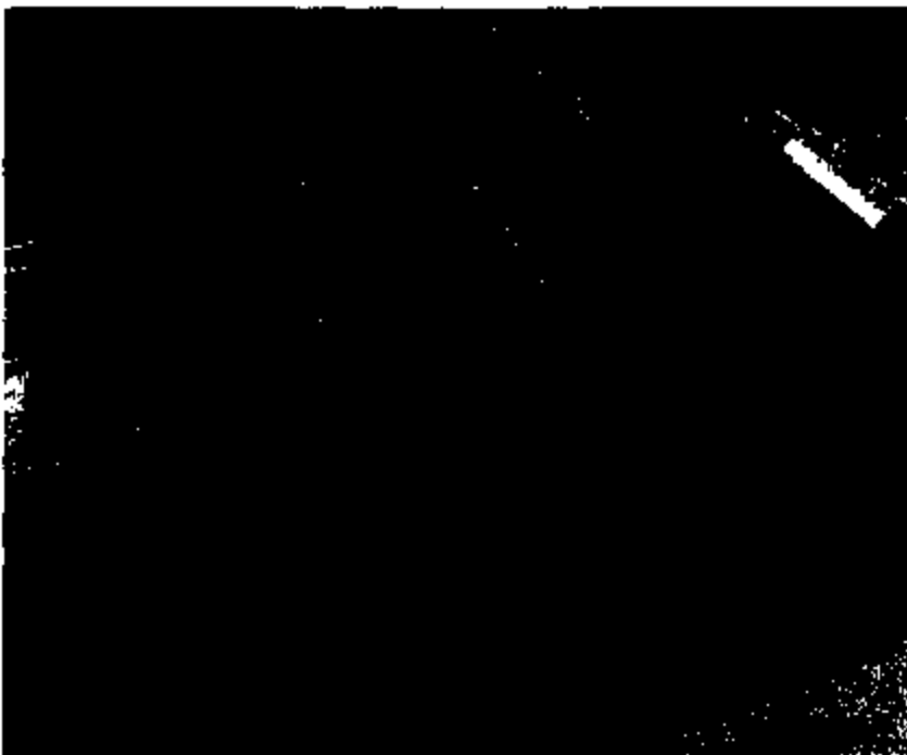
Figure 2: Picture of area after reinforcements are installed (Note doubled side tubing and inner reinforcement strap).