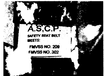
This photo shows the 'front' of the tag.