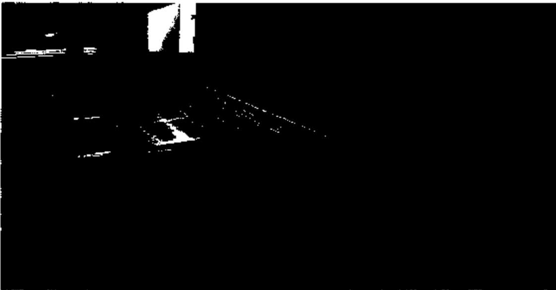
Figure 2: Close-up picture of area of weld site.