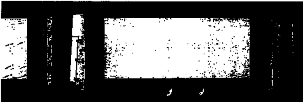
Figure 1: Overall picture of vehicle. Arrow pointing to area of weld site.