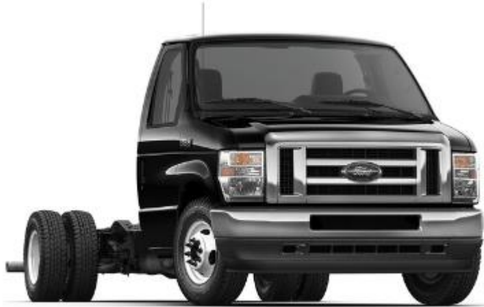
Figure 1: E-Series Cutaway Sample Image

The subject vehicles are produced by Ford in a two-wheel drive configuration only. Ford did not produce any of the subject vehicles in a four-wheel drive configuration. The subject vehicles are offered by Ford in a cutaway configuration and a stripped chassis configuration. Cutaway subject vehicles are sold by Ford with a complete passenger compartment, or cab, and have an exposed chassis that can accept aftermarket bodies.