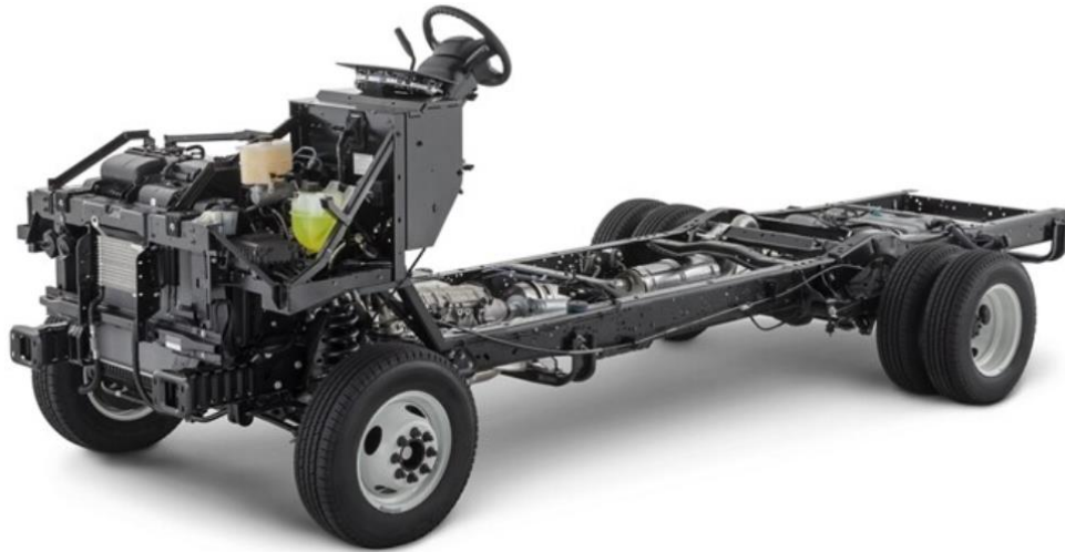
Figure 2: E-Series Stripped Chassis Sample Image

Ford does not believe that the type of vehicle, stripped chassis or cutaway, has an effect on failure conditions related to the alleged defect. Both vehicle types use a high-pressure power steering line and a jumper line to enable power steering fluid to flow from the power steering pump to the power brake assist booster. The high-pressure power steering line is unique between the stripped chassis and cutaway vehicle type. However, the jumper line and quick-connect fitting used to connect the jumper line and the high-pressure power steering line is common between the vehicle types.