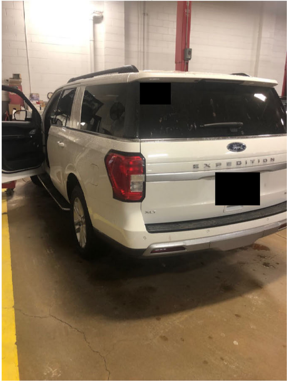
Attachment Id : 30503029