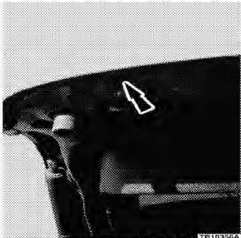
Figure 2 – Article 14-16-NA

3. Open the liftgate and install a new drain valve in each of the two (2) drain holes on the left and right side of the liftgate. Apply a slight amount of sealant on the drain valves used in the liftgate drain holes to keep them from coming loose. (Figure 2)