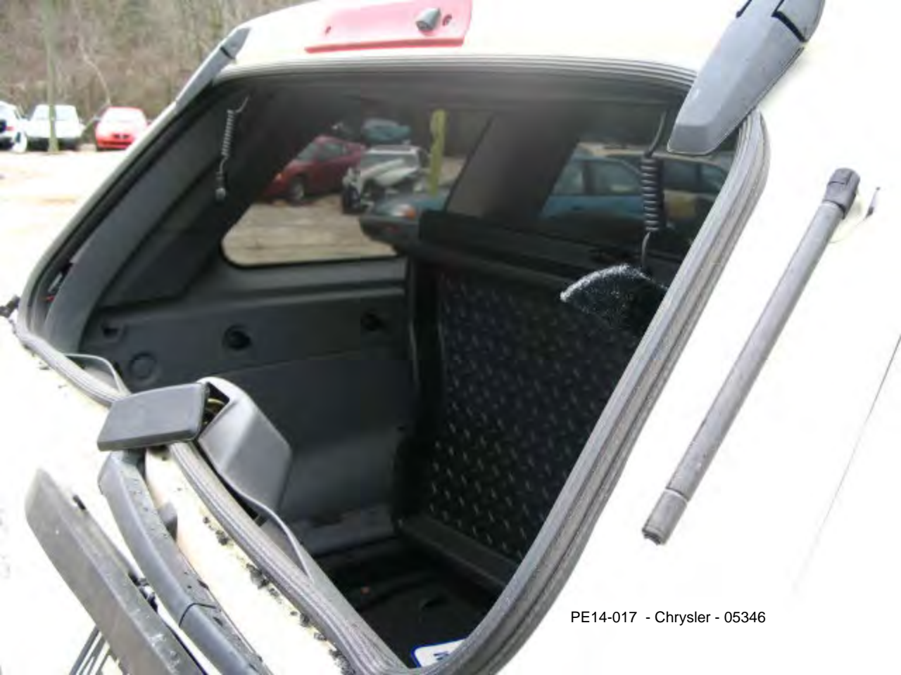
PE14-017 - Chrysler - 05346