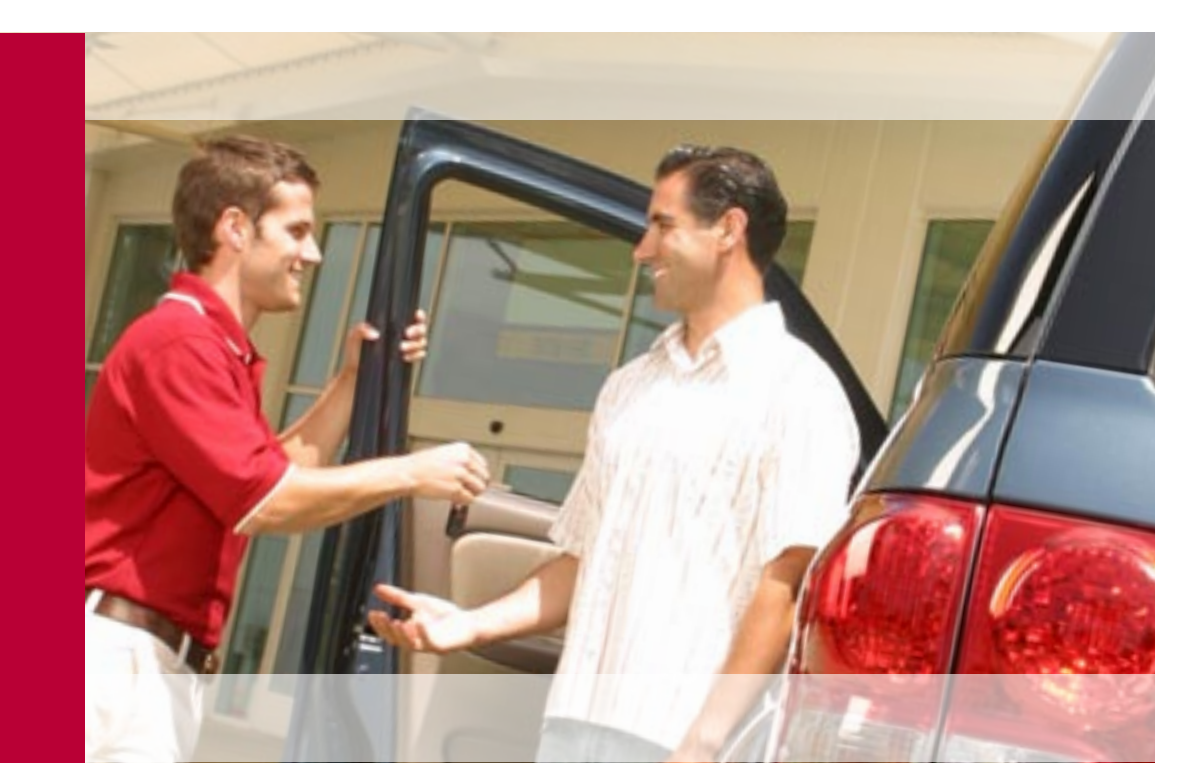
Toyota Extra Care