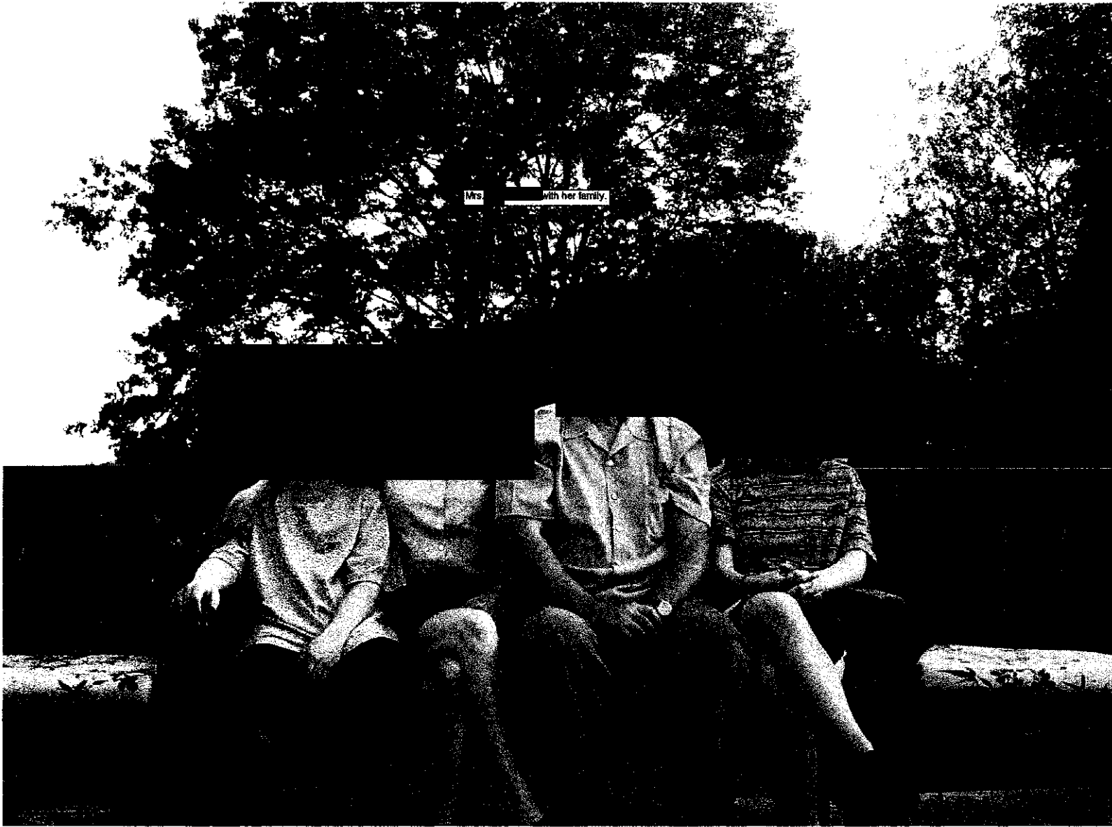
Mrs. [redacted] with her family.