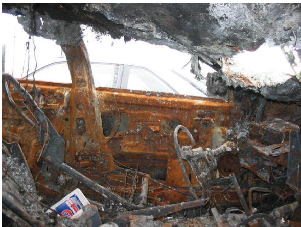
VEHICLE 1 INTERIOR 1ST ROW Look through RF door across row