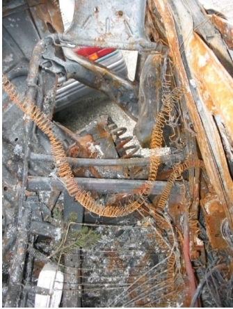
VEHICLE 1 INTERIOR 1ST ROW Seat 11