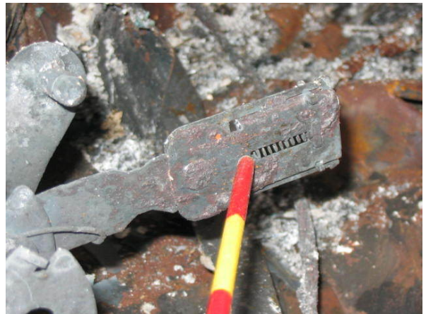
VEHICLE 1 INTERIOR 2ND ROW 23 belt latch