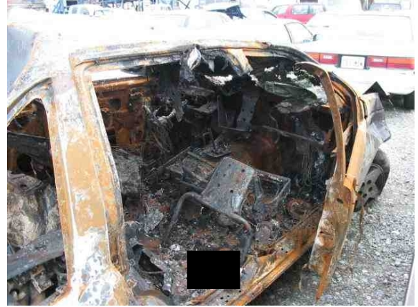
VEHICLE 1 RIGHT RIGHT middle 1/3 from back