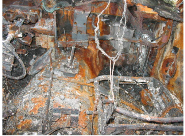
VEHICLE 1 INTERIOR 1ST ROW 12 bottom