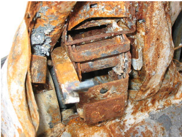
VEHICLE 1 INTERIOR 2ND ROW 21 belt retractor