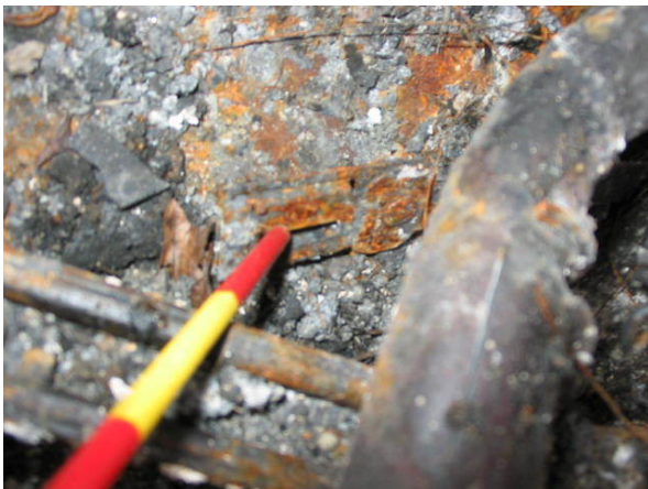
VEHICLE 1 INTERIOR 1ST ROW 11 belt latch