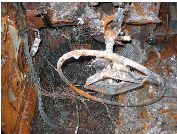
VEHICLE 1 INTERIOR 1ST ROW 11 bottom