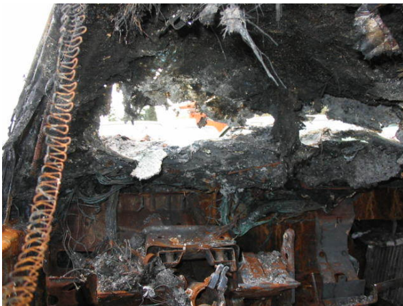
VEHICLE 1 INTERIOR 1ST ROW 11 top