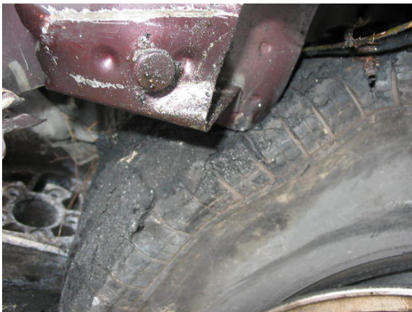
VEHICLE 1 MISCELLANEOUS LF tire melted