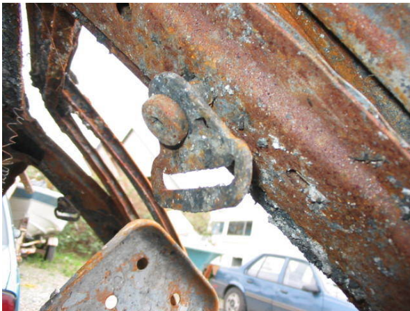
VEHICLE 1 INTERIOR 1ST ROW 11 belt adjuster