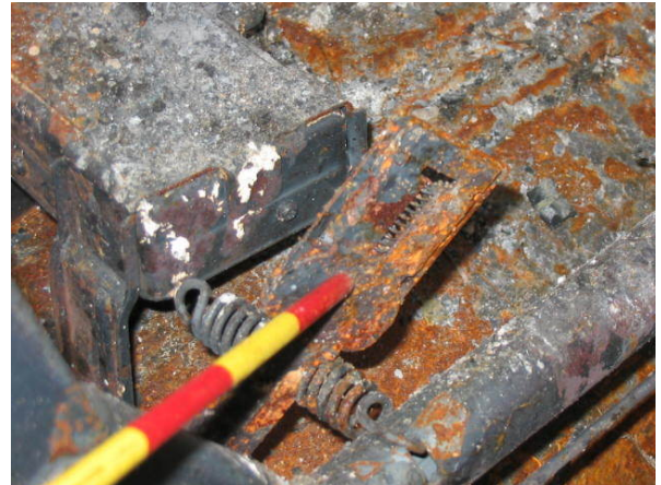
VEHICLE 1 INTERIOR 1ST ROW 13 belt latch