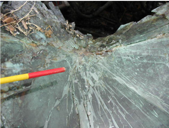
VEHICLE 1 FRONT Possible contact to windshield