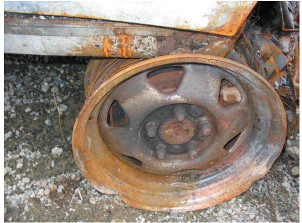
VEHICLE 1 LEFT LR tire