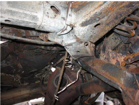
VEHICLE 1 FUEL SYSTEM Fuel tank