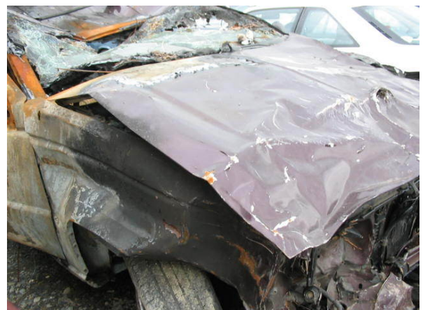
VEHICLE 1 RIGHT RIGHT front 1/3