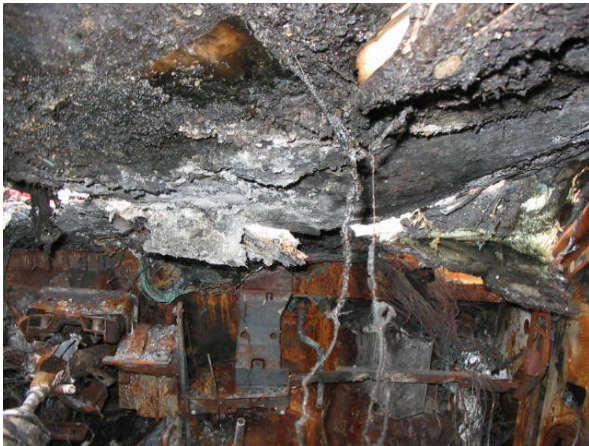
VEHICLE 1 INTERIOR 1ST ROW 12 top