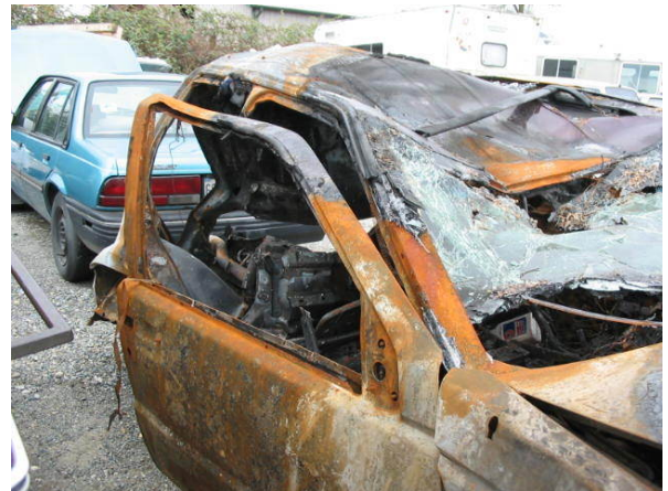
VEHICLE 1 RIGHT RIGHT middle 1/3 from front