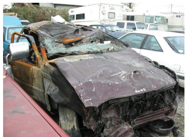
VEHICLE 1 Front/Right Oblique Front/Right Oblique