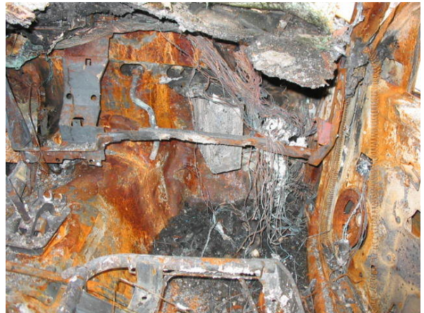
VEHICLE 1 INTERIOR 1ST ROW 13 bottom