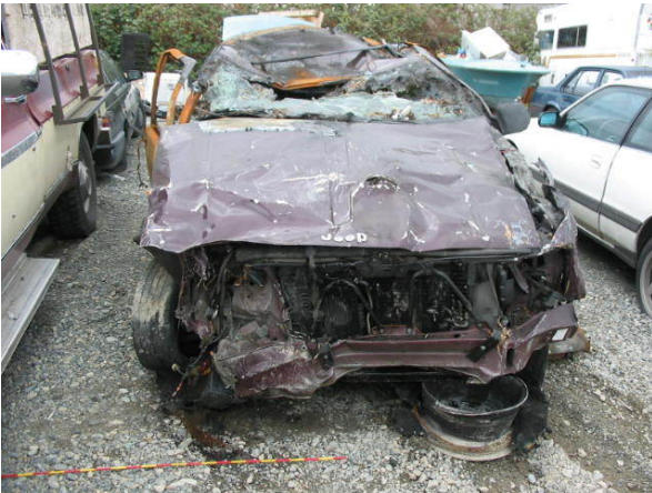
VEHICLE 1 FRONT FRONT