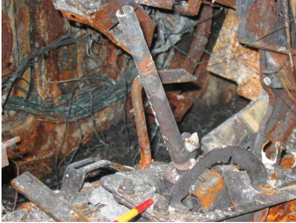
VEHICLE 1 INTERIOR 1ST ROW Transmission shifter