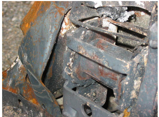
VEHICLE 1 INTERIOR 2ND ROW 23 belt retractor