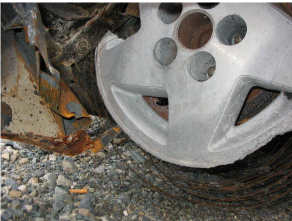
VEHICLE 1 RIGHT RR tire