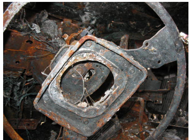
VEHICLE 1 INTERIOR 1ST ROW Steering assembly