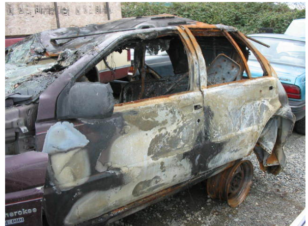
VEHICLE 1 LEFT LEFT middle 1/3 from front