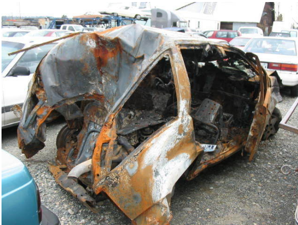
VEHICLE 1 Back/Right Oblique Back/Right Oblique