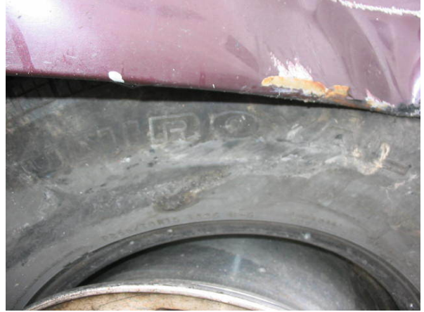
VEHICLE 1 MISCELLANEOUS Tire manufacturer