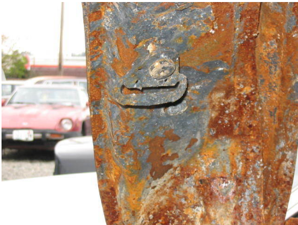
VEHICLE 1 INTERIOR 2ND ROW 21 belt adjuster