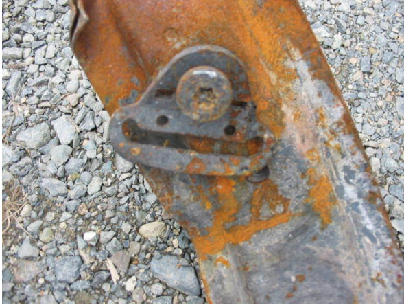
VEHICLE 1 INTERIOR 1ST ROW 13 belt adjuster