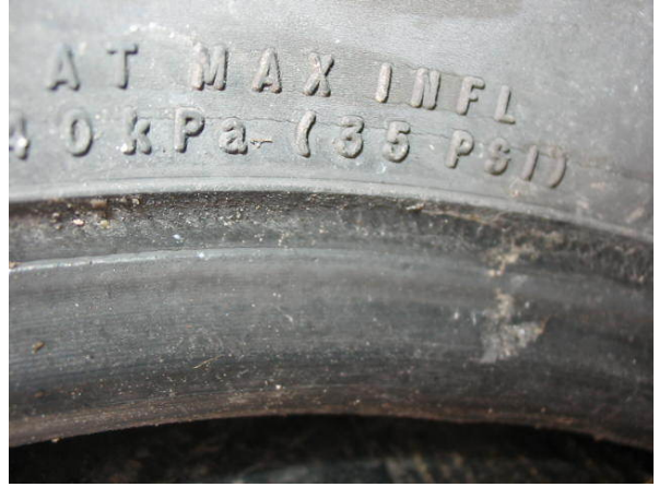
VEHICLE 1 MISCELLANEOUS Tire max pressure