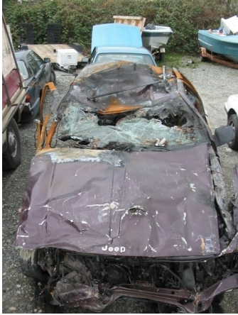
VEHICLE 1 Top Top from front