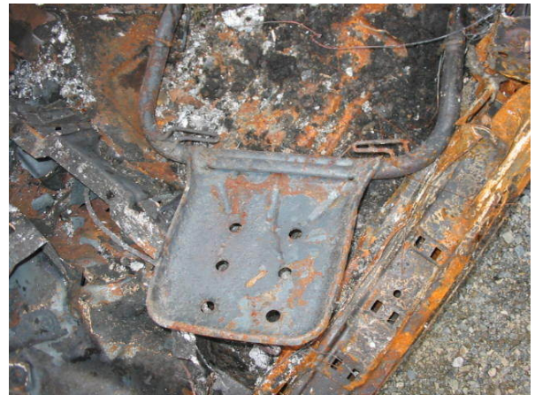
VEHICLE 1 INTERIOR 1ST ROW 13 head restraint