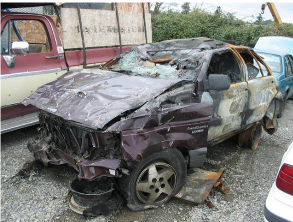
VEHICLE 1 Front/Left Oblique Front/Left Oblique