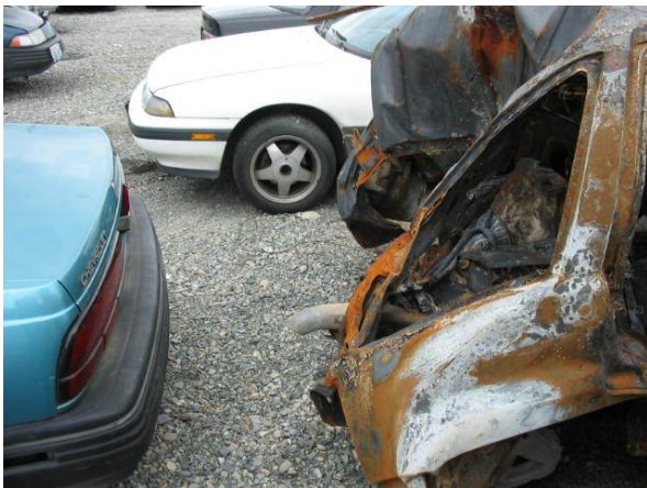
VEHICLE 1 RIGHT RIGHT back 1/3