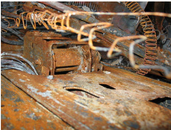
VEHICLE 1 INTERIOR 1ST ROW 11 belt retractor