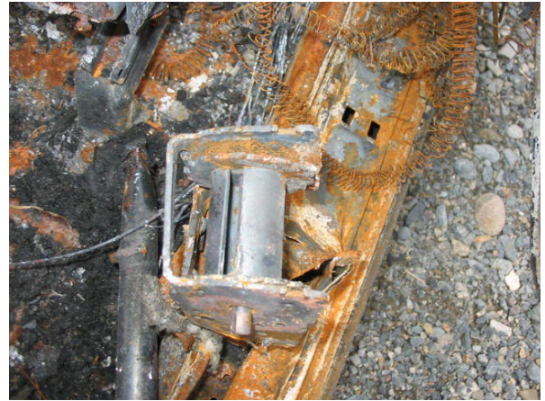
VEHICLE 1 INTERIOR 1ST ROW 13 belt retractor