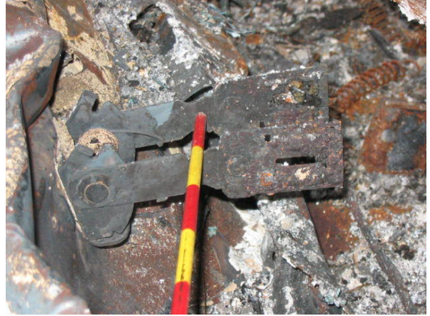
VEHICLE 1 INTERIOR 2ND ROW 21 and 22 belt latch