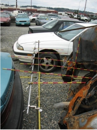
VEHICLE 1 BACK C6-C1 above bumper