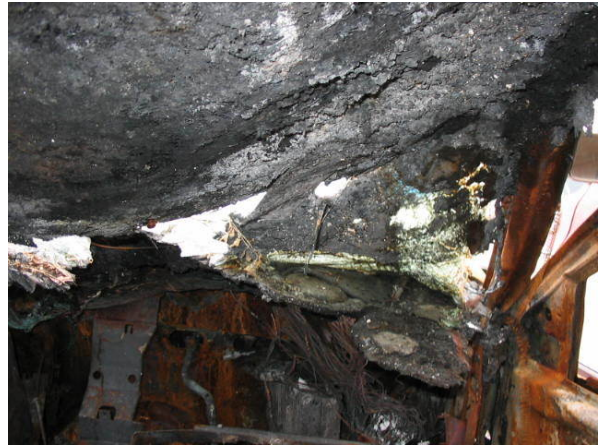
VEHICLE 1 INTERIOR 1ST ROW 13 top