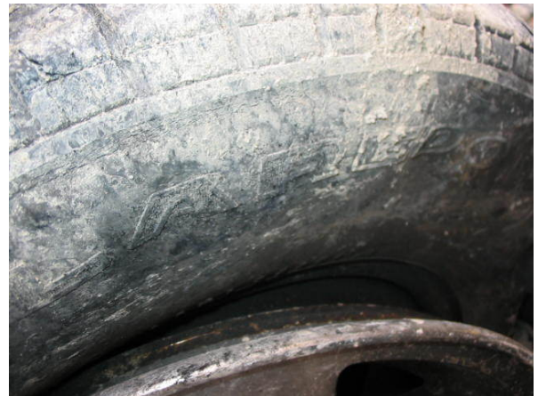
VEHICLE 1 MISCELLANEOUS Tire model