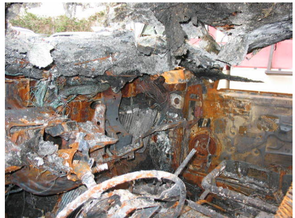
VEHICLE 1 INTERIOR 1ST ROW Look through LF door instrument pan