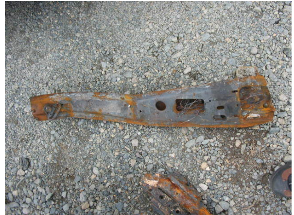
VEHICLE 1 RIGHT R "B" pillar