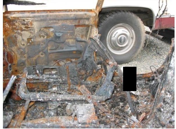
VEHICLE 1 INTERIOR 1ST ROW Seat 13