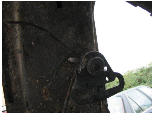
VEHICLE 1 INTERIOR 2ND ROW 23 belt adjuster