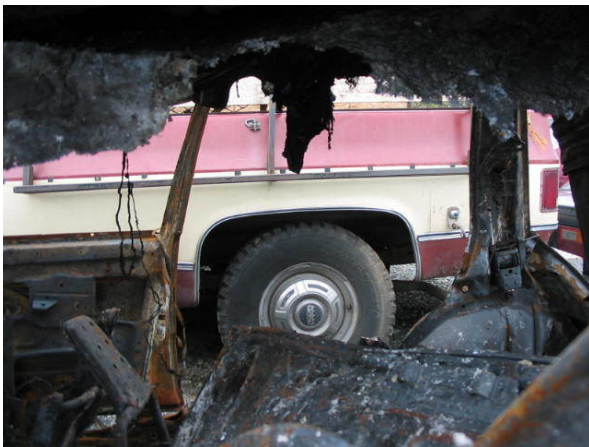
VEHICLE 1 INTERIOR 2ND ROW Look through LR door across row