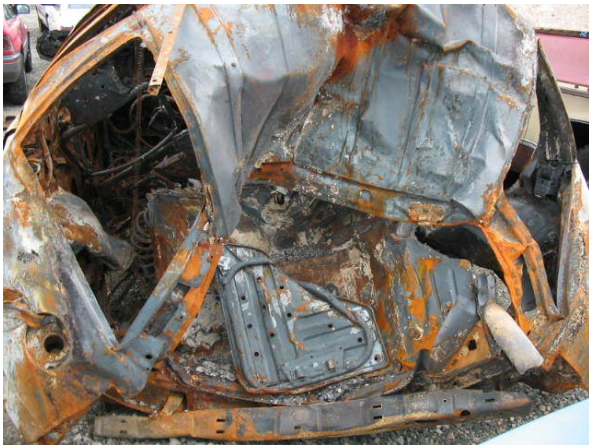
VEHICLE 1 BACK BACK