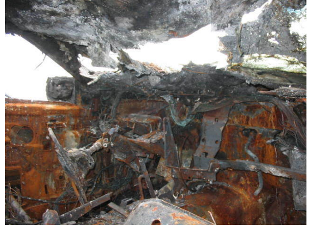
VEHICLE 1 INTERIOR 1ST ROW Look through RF door instrument pan