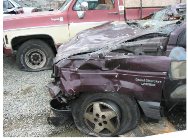
VEHICLE 1 LEFT LEFT front 1/3