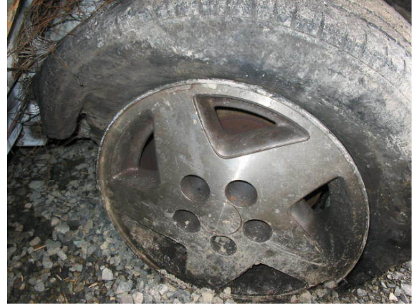
VEHICLE 1 RIGHT RF tire