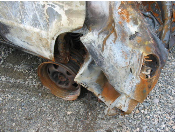
VEHICLE 1 FUEL SYSTEM Fuel filler cap location