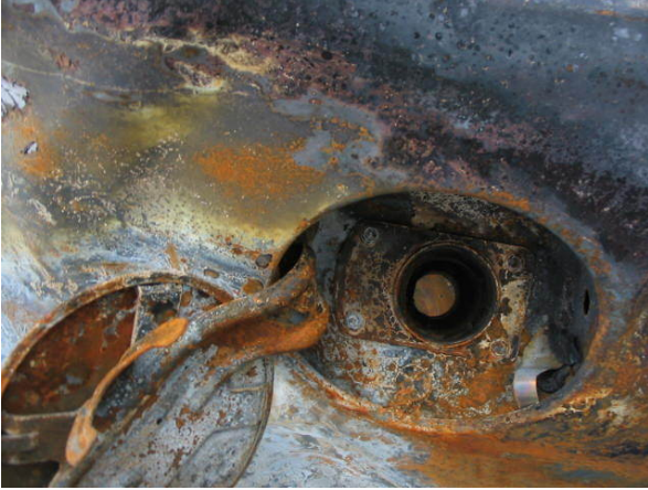
VEHICLE 1 FUEL SYSTEM Fuel filler neck