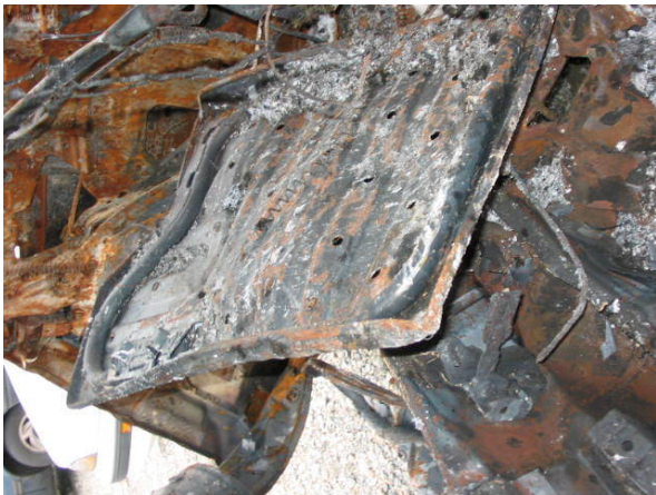
VEHICLE 1 INTERIOR 2ND ROW 2nd row seat