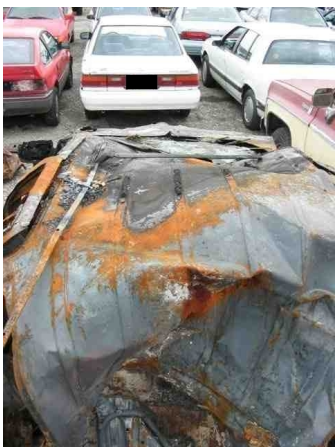
VEHICLE 1 Top Top from back