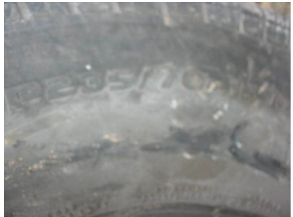
VEHICLE 1 MISCELLANEOUS Tire size