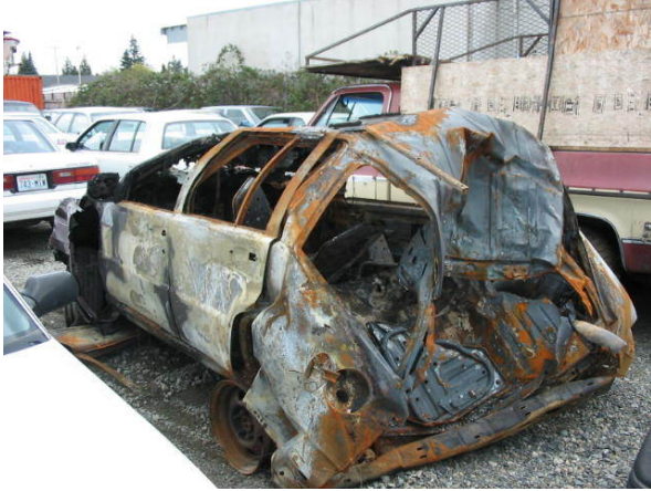
VEHICLE 1 Back/Left Oblique Back/Left Oblique