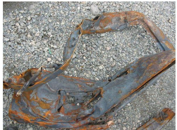
VEHICLE 1 BACK Tail gate