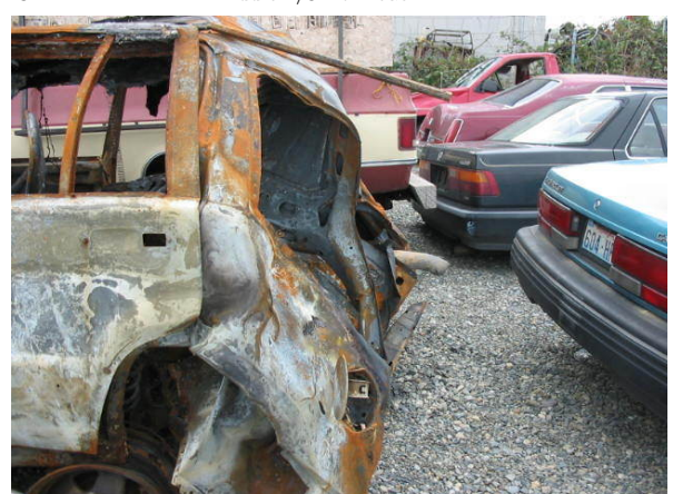
VEHICLE 1 LEFT LEFT back 1/3