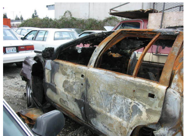
VEHICLE 1 LEFT LEFT middle 1/3 from back