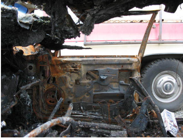
VEHICLE 1 INTERIOR 1ST ROW Look through LF door across row