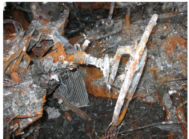
VEHICLE 1 INTERIOR 1ST ROW Steering assembly