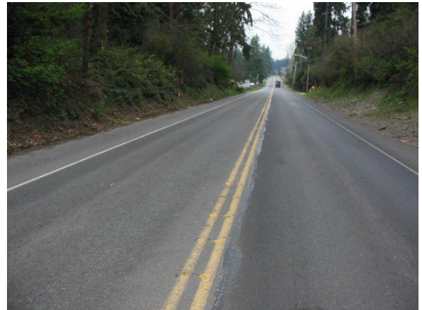
CRASH SCENE Vehicle Approach - Vehicle Approach - 2