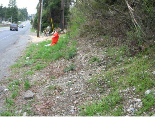
CRASH SCENE Vehicle Approach - Vehicle Approach - 9