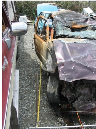
VEHICLE 1 RIGHT Look down right side front to back