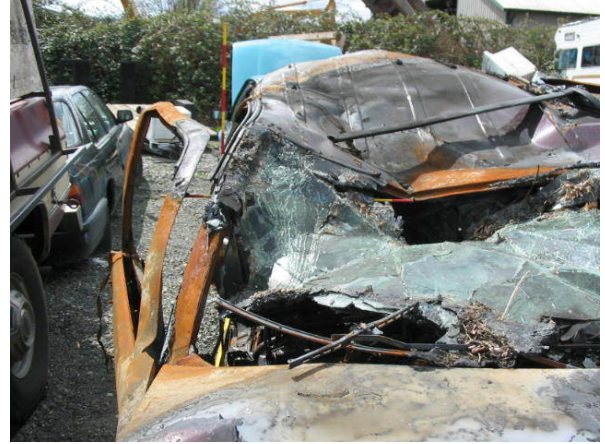
VEHICLE 1 RIGHT Rollover max crush