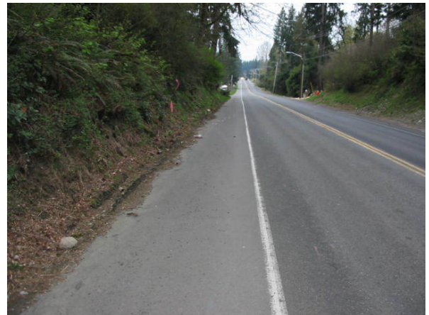
CRASH SCENE Vehicle Approach - Vehicle Approach - 3