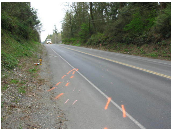
CRASH SCENE LOOK BACK Look Back from road departure to pr