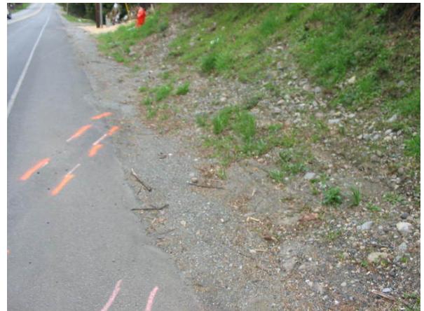
CRASH SCENE Vehicle Approach - Vehicle Approach - 7