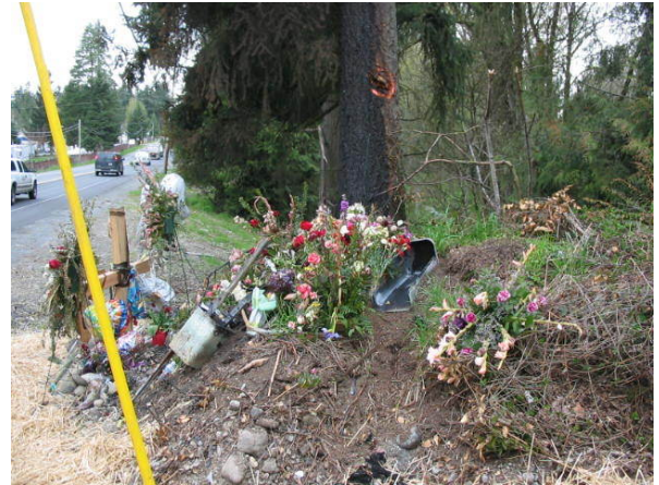
CRASH SCENE Vehicle Path to Final Rest - Vehicle Path to Final Rest - 4