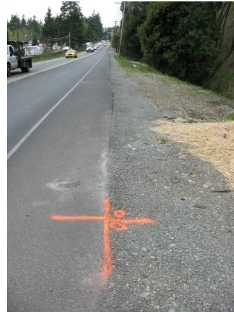
CRASH SCENE MISCELLANEOUS VIEWS RL looking north