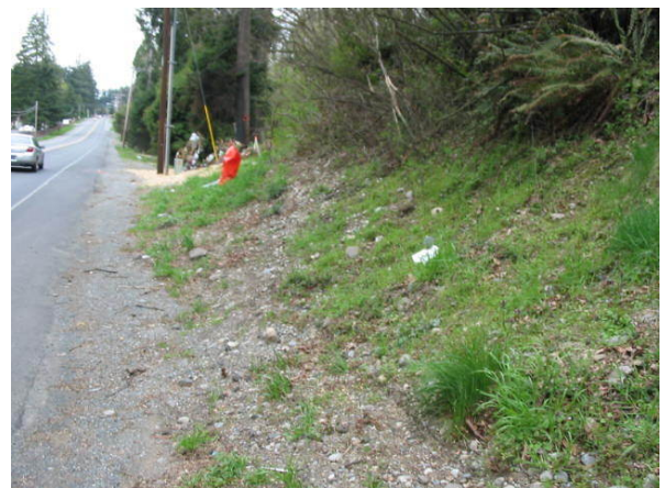
CRASH SCENE Vehicle Approach - Vehicle Approach - 8