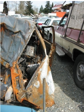
VEHICLE 1 RIGHT Look down right side back to front