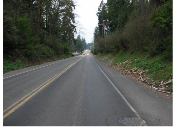
CRASH SCENE Vehicle Approach - Vehicle Approach - 1