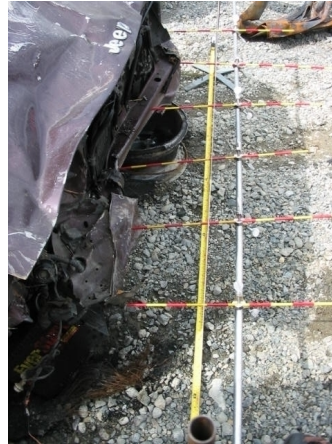
VEHICLE 1 FRONT C6-C1