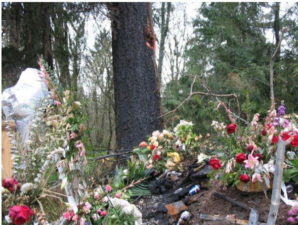
CRASH SCENE Lookback Beyond Final Rest to Impact Lookback Beyond Final Rest to Impact