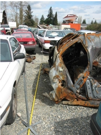
VEHICLE 1 LEFT Look down left side back to front