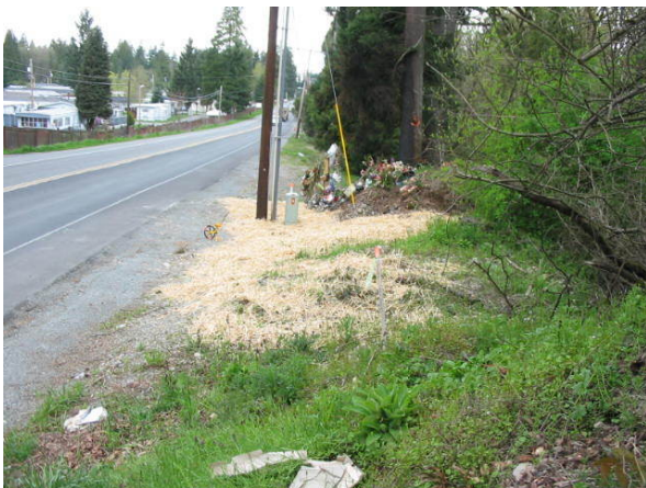
CRASH SCENE Vehicle Path to Final Rest - Vehicle Path to Final Rest - 1