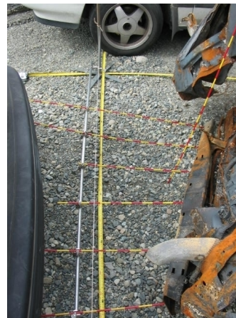
VEHICLE 1 BACK C6-C1 bumper