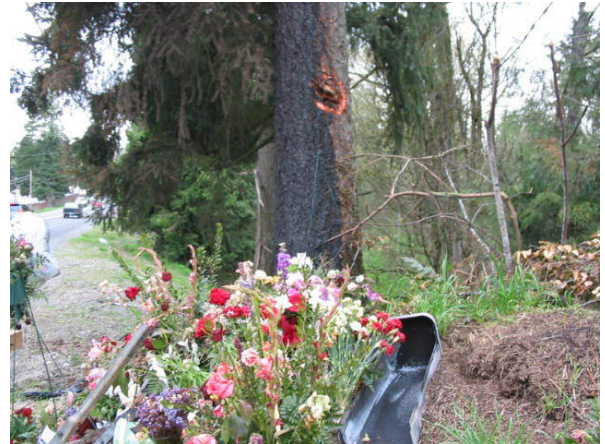
CRASH SCENE Vehicle Path to Final Rest - Vehicle Path to Final Rest - 5