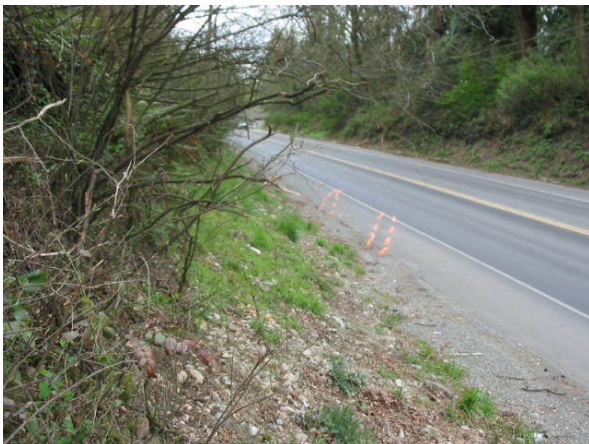
CRASH SCENE Lookback From Impact to PreCrash - Lookback From Impact 1 to Pre-Crash