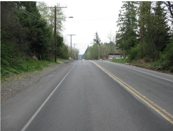
CRASH SCENE LOOK BACK LOOK BACK