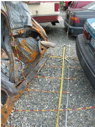
VEHICLE 1 BACK C1-C6 bumper