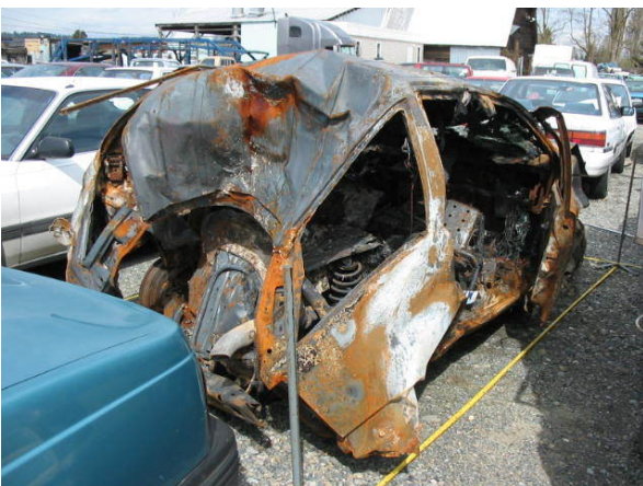
VEHICLE 1 RIGHT Right side back to front