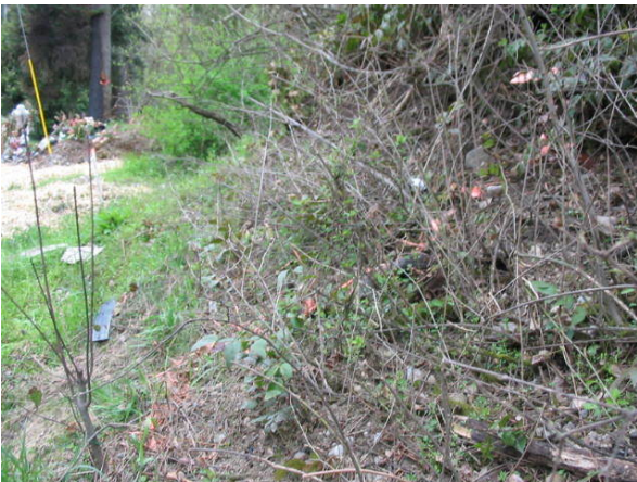
CRASH SCENE Vehicle Point of Impact - Vehicle Point of Impact - 1