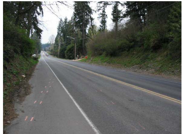
CRASH SCENE Vehicle Approach - Vehicle Approach - 4