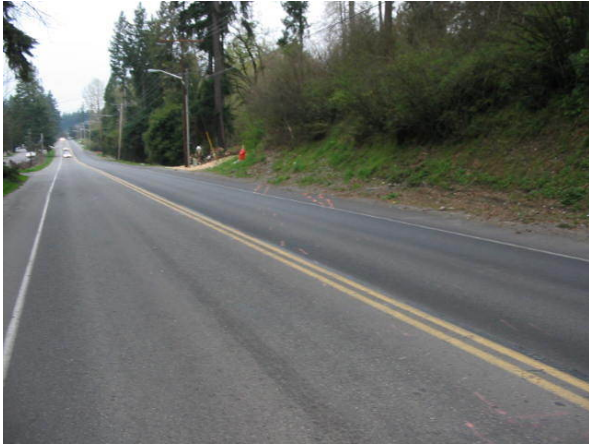
CRASH SCENE Vehicle Approach - Vehicle Approach - 5