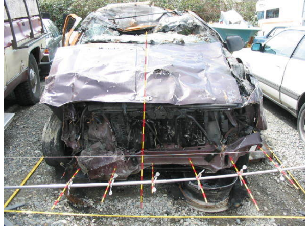
VEHICLE 1 FRONT FRONT with gauges set at bumper lev