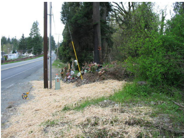
CRASH SCENE Vehicle Path to Final Rest - Vehicle Path to Final Rest - 2