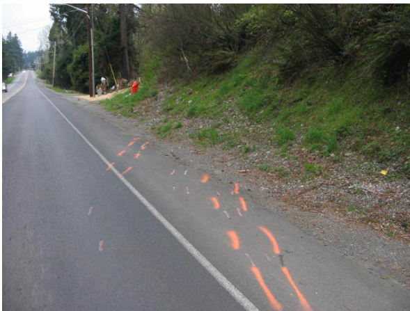
CRASH SCENE Vehicle Approach - Vehicle Approach - 6