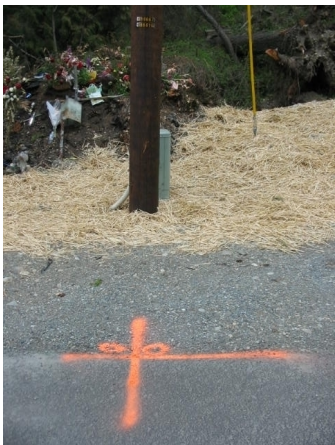
CRASH SCENE MISCELLANEOUS VIEWS RP/Origin