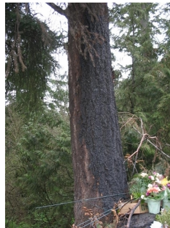
CRASH SCENE MISCELLANEOUS VIEWS Fire damage to tree (POI 2)