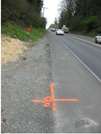
CRASH SCENE MISCELLANEOUS VIEWS RL looking south