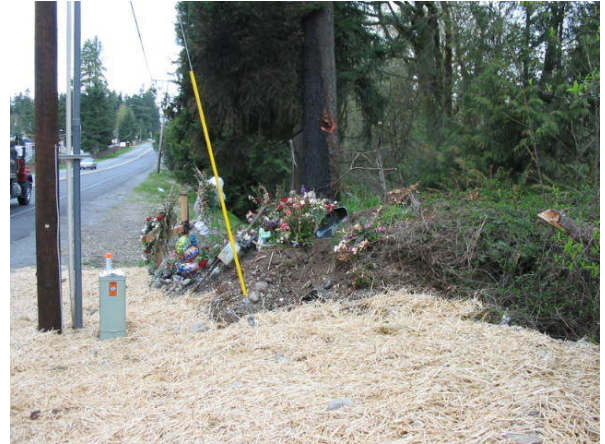
CRASH SCENE Vehicle Path to Final Rest - Vehicle Path to Final Rest - 3