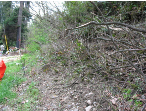
CRASH SCENE Vehicle Approach - Vehicle Approach - 10