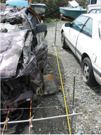
VEHICLE 1 LEFT Look down left side front to back