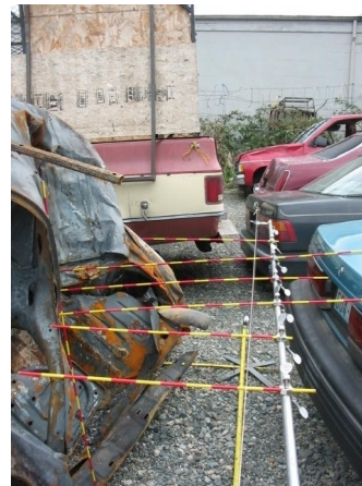
VEHICLE 1 BACK C1-C6 above bumper