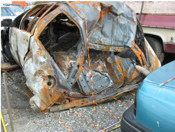
VEHICLE 1 BACK BACK with gauges set at bumper