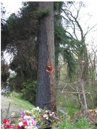
CRASH SCENE Vehicle Point of Impact - Vehicle Point of Impact - 2