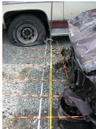
VEHICLE 1 FRONT C1-C6