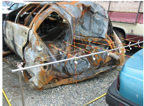
VEHICLE 1 BACK BACK with gauges above bumper