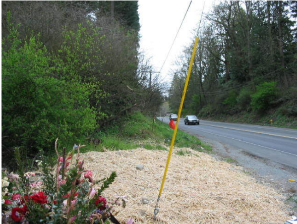
CRASH SCENE Lookback From Impact to PreCrash - Lookback From Impact 2 to Pre-Crash