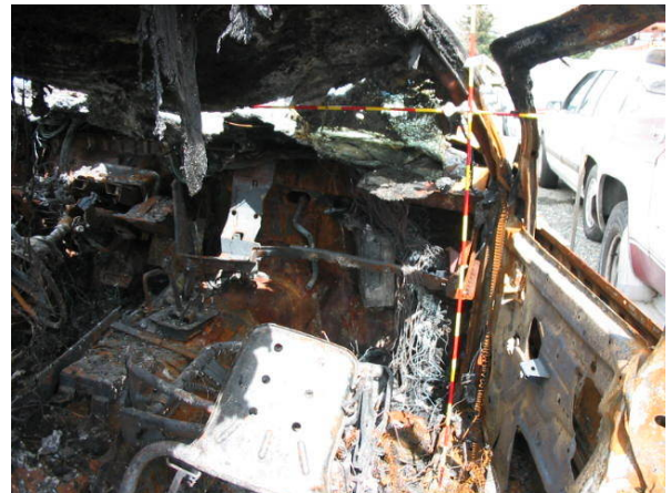
VEHICLE 1 RIGHT Rollover max crush