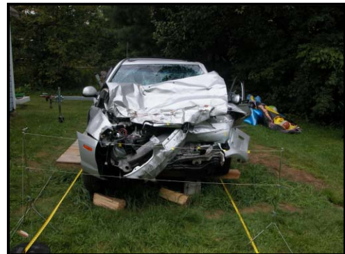
Figure 3: Front view of the Hyundai Elantra.

The front plane of the Hyundai sustained 142.2 cm (56.0 in) of direct contact damage that extended across the entire end width of the vehicle, Figure 3 . The frontal damage was biased to the left indicative of the angular offset impact configuration. The crush profile documented along the front bumper was as follows: C1 = 78 cm (30.7 in), C2 = 79.0 cm (31.1 in), C3 = 84.0 cm (33.1 in), C4 = 67.0 cm (26.4 in), C5 = 58.0 cm (22.8 in), C6 = 22.0 cm (8.7 in). Maximum crush was located at the left front corner (C1).