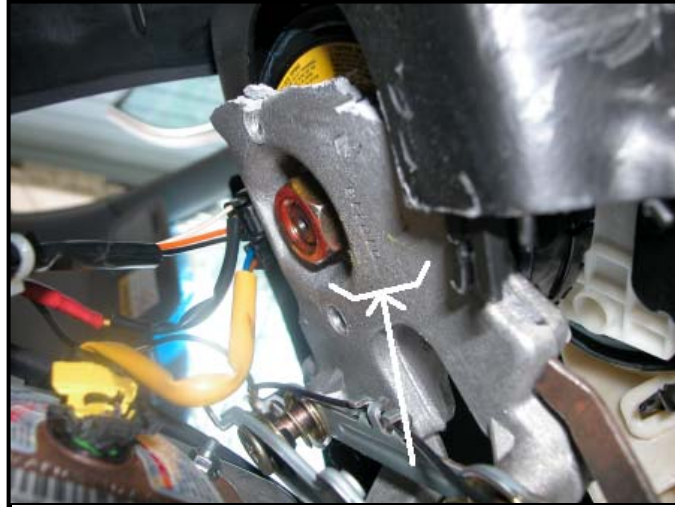
Figure 15: View of the fractured casting and yellow transfers.