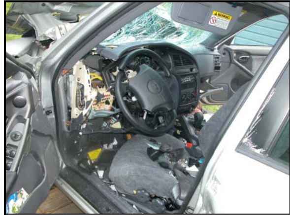
Figure 7: Driver's interior view.

The driver's knee bolster exhibited two contacts from the driver's lower extremities. The right lower extremity contacted the bolster 22.9 cm (9.0 in) left of the steering wheel center line. The bolster's metal backer was deformed 5.1 cm (2.0 in) at this location. The right lower extremities contacted and penetrated the bolster 3.8 cm (1.5 in). This contact was located 17.8 cm (7.0 in) right of the steering wheel center line.