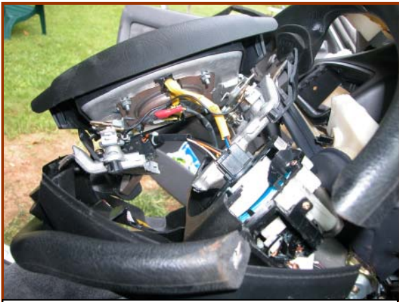
Figure 13: Left lateral view of the DAB.

The driver bag was a located in the center hub of the steering wheel. It was not deployed. Figure 13 is a lateral view of the driver air bag module attached to the fractured casting. Figure 14 is a close-up view of the back side of the module and the inflator. The inflator was manufactured by Autoliv Inc. and was identified by the following: MAF M27 1M AOH . Inspection of the inflator determined the electrical connector was still attached to the inflator; however, the connector was crushed. The connector had impacted the casting, when the casting was fractured by driver loading. Figure 15 is a close-up view of the casting. Yellow transfers from the connector's housing were identified on the casting indicative of the contact. It should be noted that this contact sequence occurred late in the overall crash sequence and would not have compromised the proper deployment of the driver air bag.