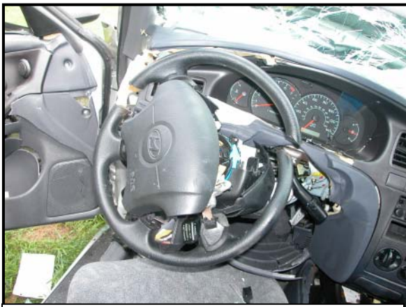
Figure 8: View of the steering wheel rim.

The 4-spoke steering wheel rim was rotated approximately 90 degrees clockwise at inspection. The steering column was completely separated from the shear capsules and the column had dropped. The left and right shear separation measured 5.1 cm (2.0 in) and 4.6 cm (1.8 in), respectively. The steering wheel rim support casting (fastened to the steering column end) was fractured by inertial loading from the occupant. The steering wheel rim was cut in 1 and 9 o'clock sectors during the extrication process for unknown reasons. Figure 8 is a view of the deformed steering wheel rim. Figure 9 is a lateral view across the steering wheel viewed from the 1 o'clock sector to the 8 o'clock sector of the fractured casting.