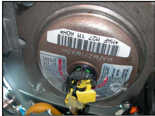
Figure 14: View of the DAB inflator.