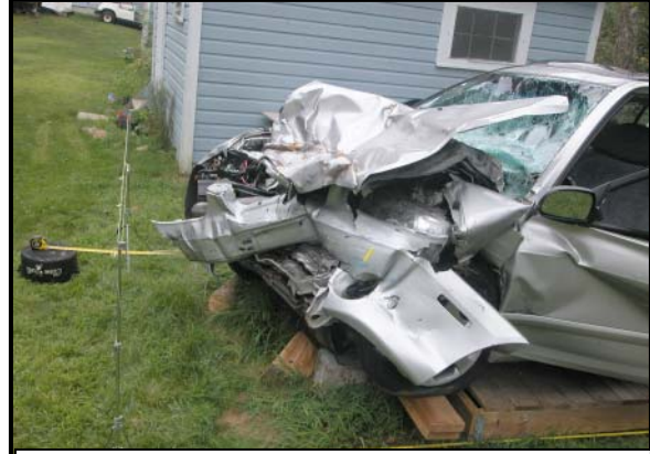
Figure 5: Left lateral view.