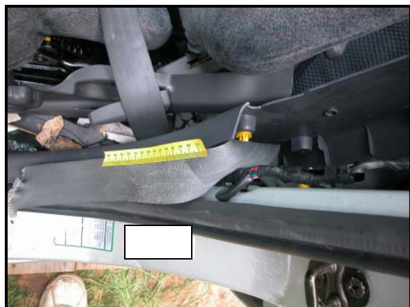
Figure 11: D-ring abrasion to the driver's restraint webbing.

Inspection of the driver's safety belt indicated the first responders had cut the driver's safety belt during the extrication. A 140 cm (55 in) section of webbing was attached to the outboard anchor. This section of webbing had been used to tie the left front door closed during vehicle transport. The use of the belt in this manner hampered the identification of any crash related evidence on the webbing. The balance of the driver's webbing was spooled back into the retractor. The retractor was operational; the pretensioner had not fired. The webbing was extended from the retractor and an 8.9 cm (3.5 in) D-ring abrasion was identified, Figure 11 . The abrasion began 15 cm (6 in) from the point where the webbing was cut. The driver's D-ring was adjusted in the full down position. Inspection of the friction surface of the D-ring identified a corresponding abrasion across the full width of the surface. Inspection of the latch plate revealed indications of historical use and crash related abrasions on its friction surface. The inspection of the driver's safety belt indicated that he was restrained at the time of the crash.