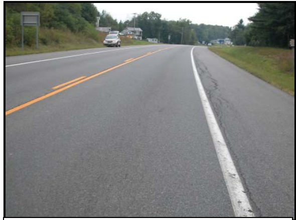
Figure 2: Northbound trajectory view.

The two-vehicle crash occurred during the nighttime hours in August 2003. At the time of the crash, it was dark without artificial lighting and the weather was not a factor. The road surface was dry. The crash occurred on a two-lane north/south state route in a rural setting. The combined width of the asphalt travel lanes measured 7 m (23 ft). The paved shoulders bordering the travel lanes measured 3 m (10 ft). There was a shallow right curve and a positive grade in the northbound direction. The road was marked with a passing zone in the southbound direction. The speed limit in the area of the crash was 89 km/h (55 mph). Figure 2 is a northbound trajectory views at the crash site.