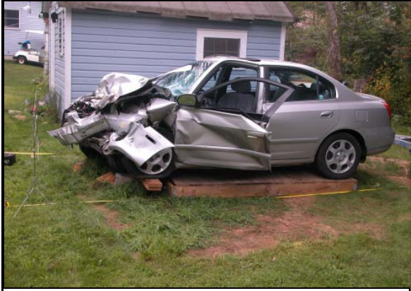
Figure 4: Left side view of the Hyundai.