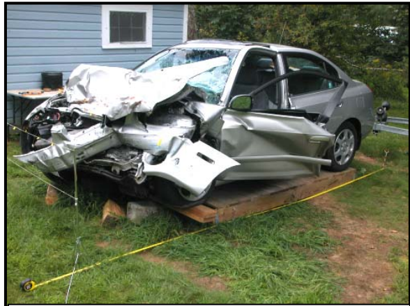
Figure 1: Left front view of the Hyundai.

This investigation focused on the issues surrounding the driver air bag non-deployment, and the fatal injury mechanisms of a male driver of a 2001 Hyundai Elantra, Figure 1 . The Hyundai was involved in a severe frontal impact with a 1995 Chevrolet G20 cargo van. The Hyundai Elantra was equipped with an Advanced Occupant Protection System (AOPS) that consisted of front safety belt pretensioners, redesigned frontal air bags and front right occupant detection. The Hyundai's safety belt pretensioners and frontal air bags failed to deploy as a result of the impact. The Hyundai was occupied by a 27 year old restrained male driver and was the vehicle's sole occupant. Reportedly, the Hyundai drifted left of center precipitating the crash. The Chevrolet van was equipped with a Supplemental Restraint System that consisted of a driver (only) air bag that deployed during the crash. The estimated travel speed of the Hyundai was 89 km/h (55 mph). The Coroner's report listed the Hyundai driver's immediate cause of death as a lacerated aorta and a cervical spine fracture.