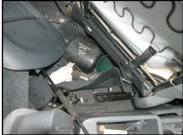
Figure 10: View of the driver's separated inboard seat track.

The driver's seat was adjusted in a mid-to-rear track position. The seat was jammed by floor pan deformation and could not be moved. The seat back was reclined 12 degrees aft of vertical. Upon inspection, it was noted that the driver's seat cushion was rotated approximately 30 degrees counterclockwise (refer to Figure 8 above) with respect to the vehicle's longitudinal axis. Further inspection revealed the adjustable portion of the rear inboard seat track had separated from the fixed portion of the inboard seat track, Figure 10 . The separation occurred as a result of the driver loading the lap portion of the locked safety belt. The inboard safety belt buckle was attached to the inboard seat track and was the load path between the driver and the fixed portion of the seat track.