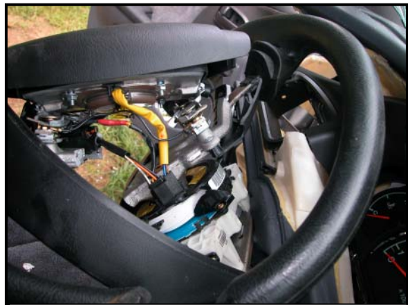
Figure 9: Lateral view across the plane of the steering wheel from 1 to 8 o'clock.