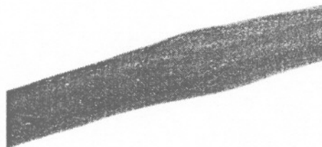
Irregularities in the size and shape of the cable