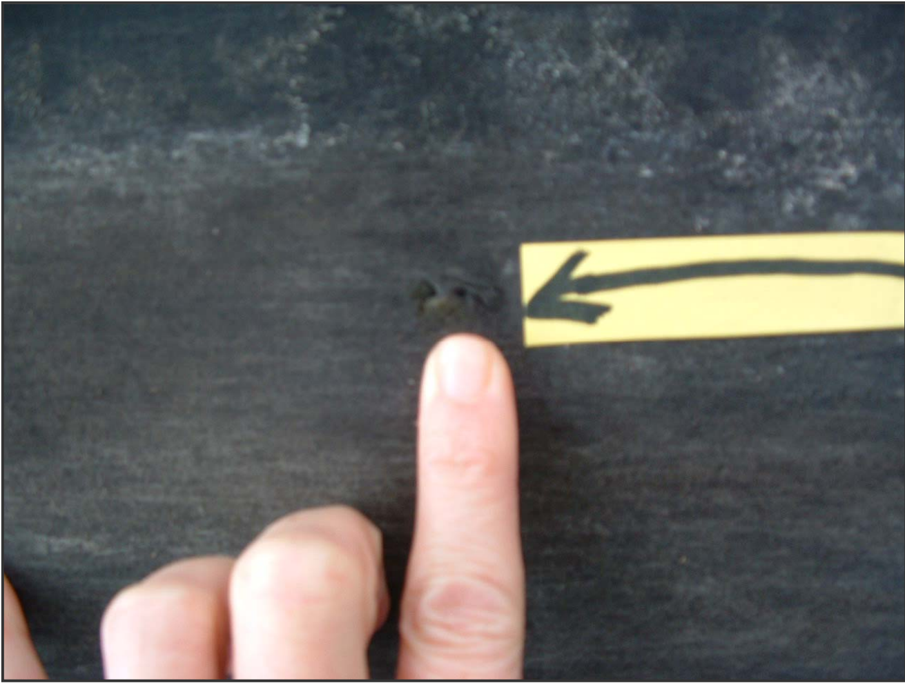
VOQ 1014330 [REDACTED] 0316 Damage to hood liner