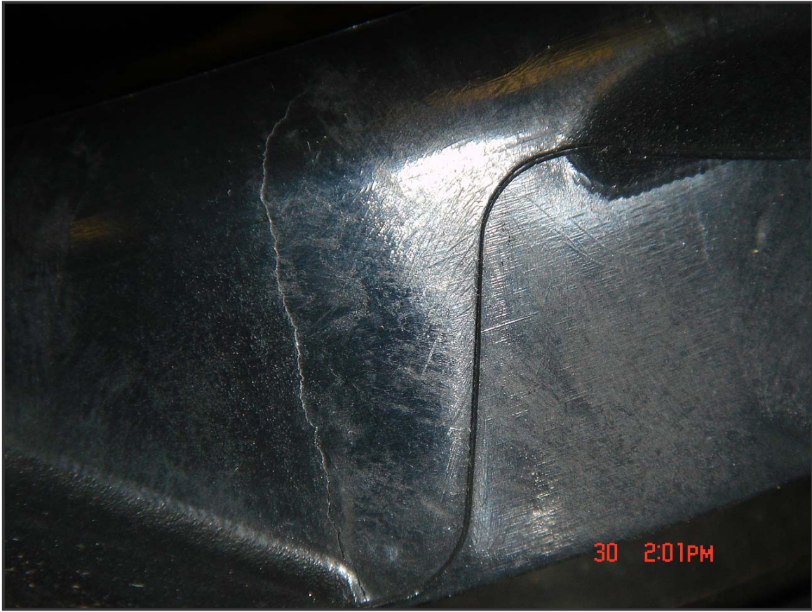
VOQ 10132799_ [REDACTED] Fan 033 Crack in fan hub