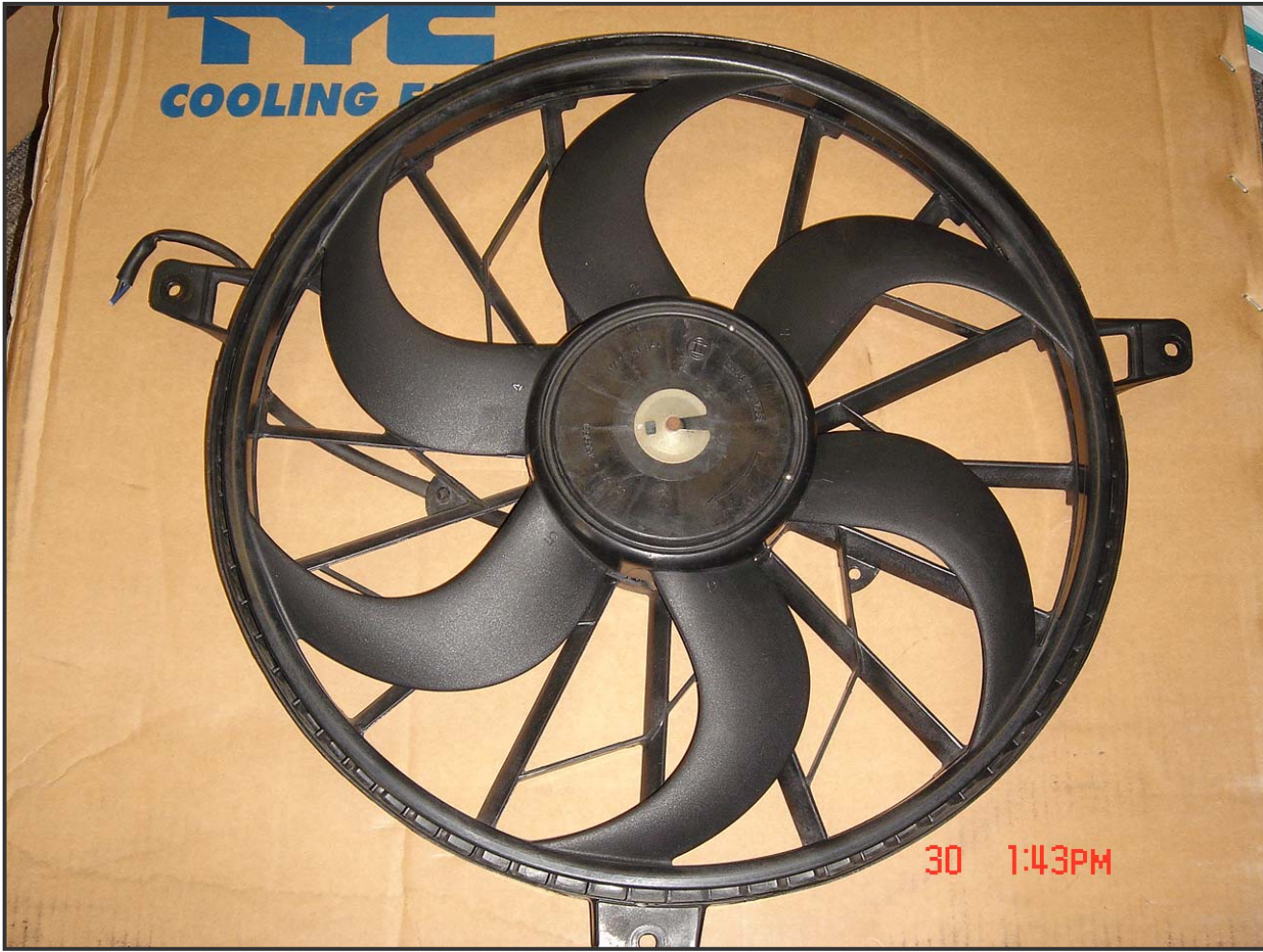
VOQ 10132799 [REDACTED] Fan 009 Fan Assembly