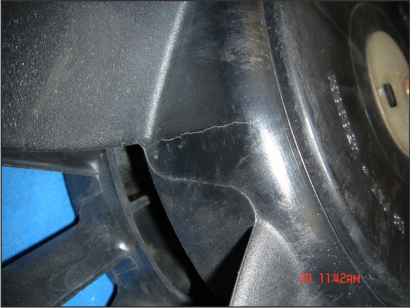
VOQ 10132799 [REDACTED] Fan 003 Crack in fan hub