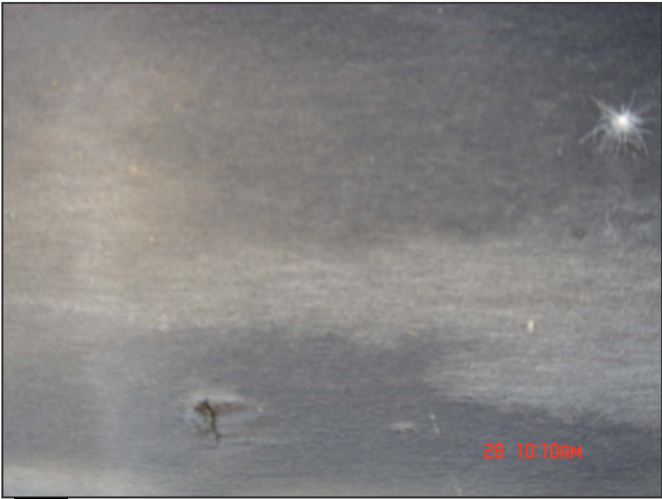
DCC [redacted] Hood_Insul 014 Dam liner