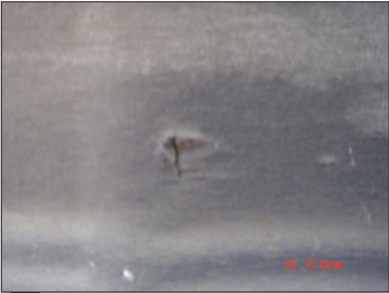
DCC [redacted] Hood_Insul_016 Dama [redacted] liner