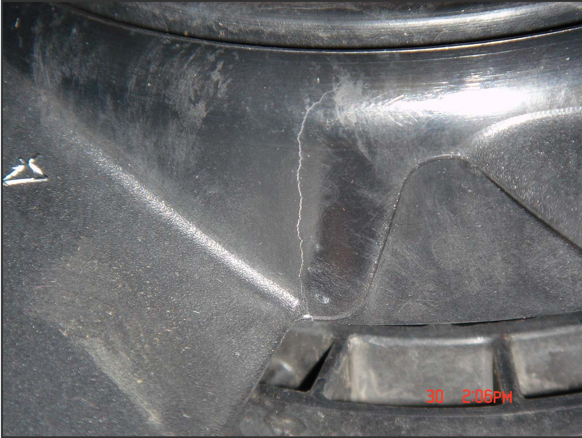
VOQ 10132799_ [REDACTED] Fan 043 Crack in fan hub