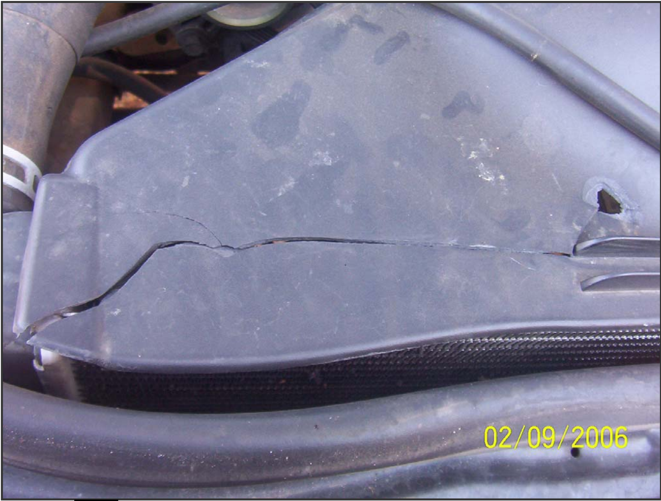
VOQ 10149058 [REDACTED] 4938 Damage to fan s