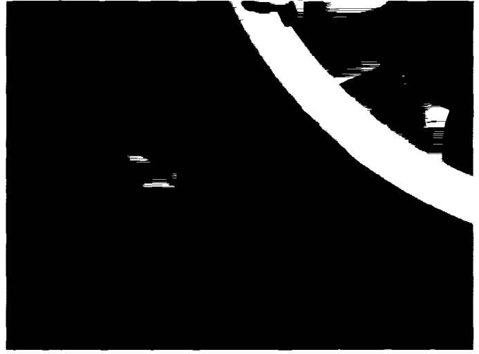
Left rear tire scuff and rim damage.